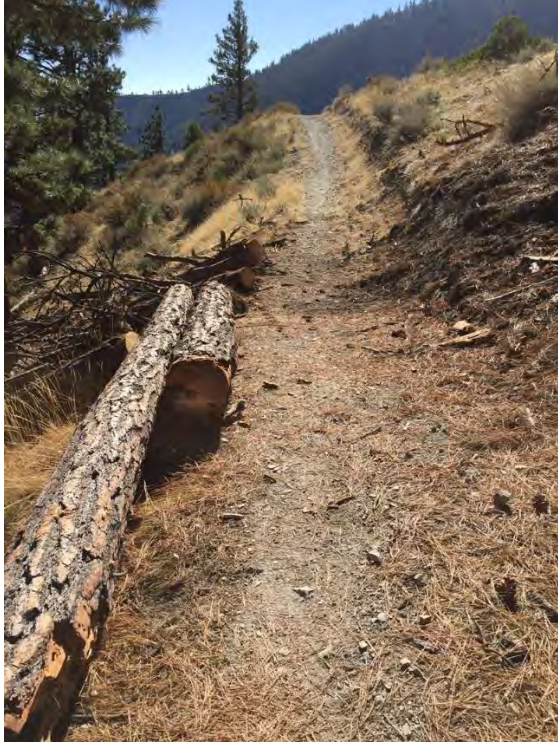
Genoa Loop trio of trees