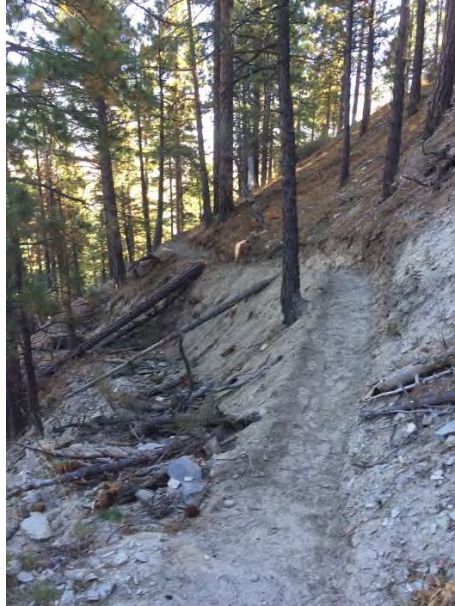
Landslide Area Realigned

6) A 175-ft realignment was done on a turn below the landslide to eliminate a steep trail section.