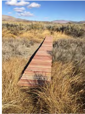
35-foot new section