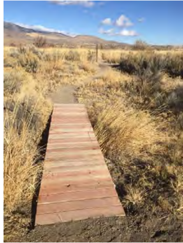
15-foot new section