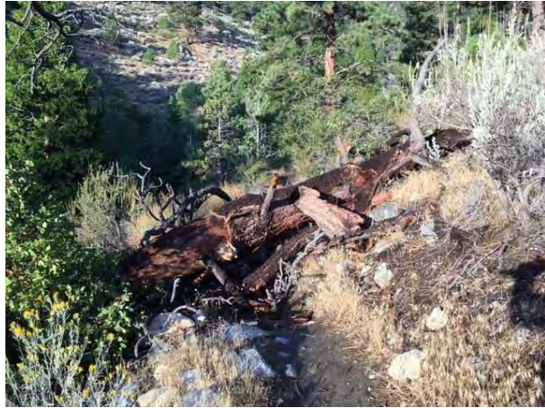
Lower Sierra Canyon Trail tree

2) Part of the handrail in Genoa Canyon was repaired.