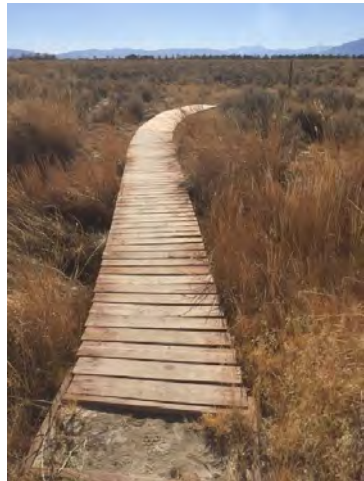
15-foot new extension