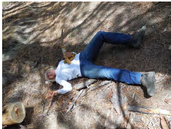
After (C'mon, was it that exhausting?)