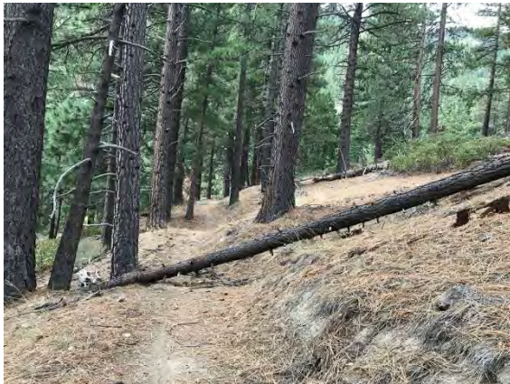
Middle Sierra Canyon Trail tree before