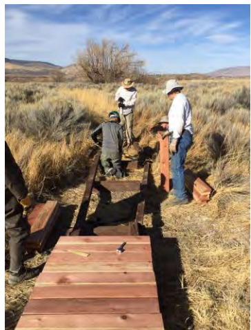
30-foot new section