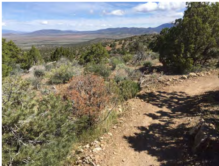
Routine tread work on Pinyon Trail

1) Routine general maintenance was done.