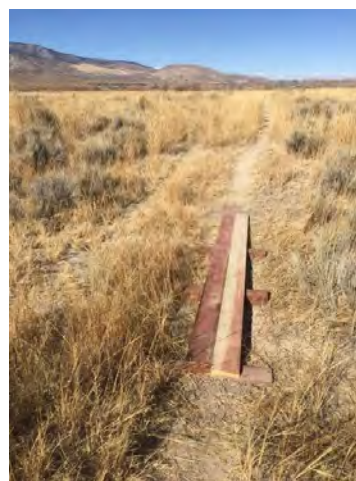
12-foot new section