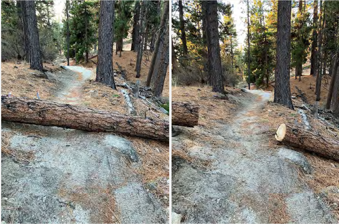
Clear Creek Trail-Before and after

4) Twelve fallen trees were removed from the Clear Creek Trail and Clear Creek Connector.