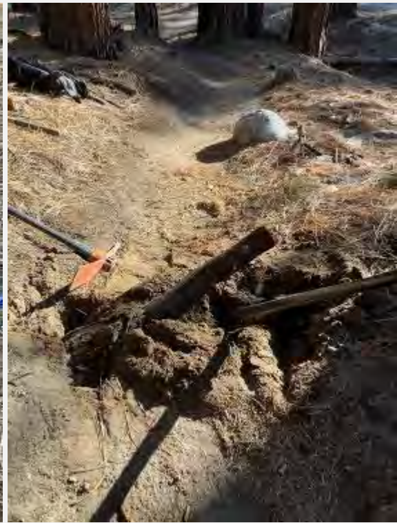
Root removal-Clear Creek Trail