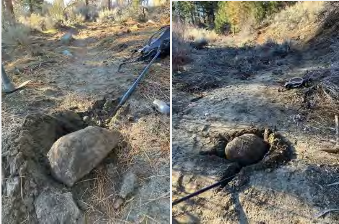
Rocks removed-Bitter Cherry Trail