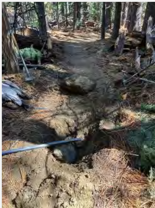
Rocks removed-Interpretive Loop