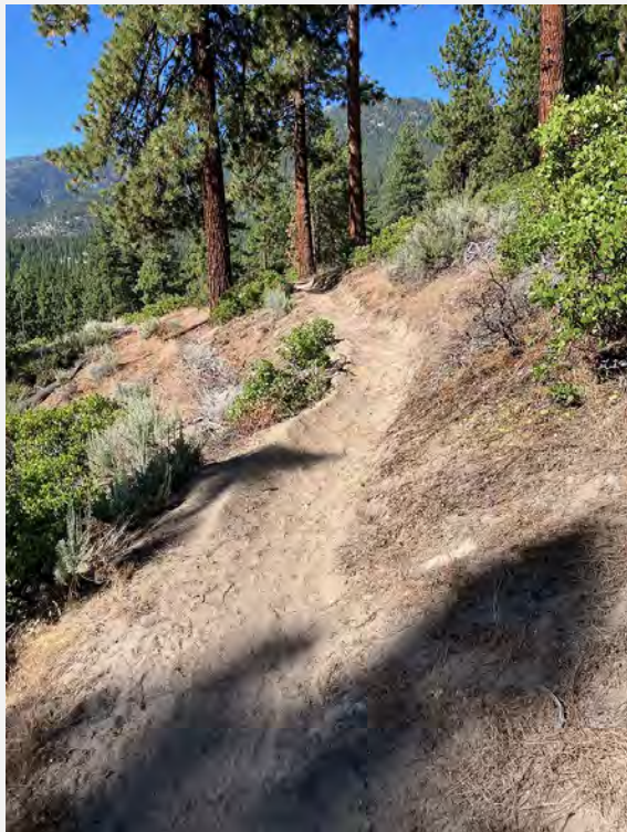
Trail widening-Clear Creek Connector