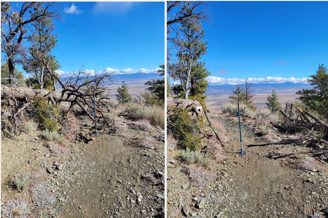
Eagle Ridge Loop-Before and after