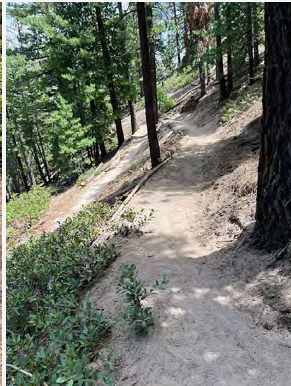
Trail widening-Clear Creek Trail