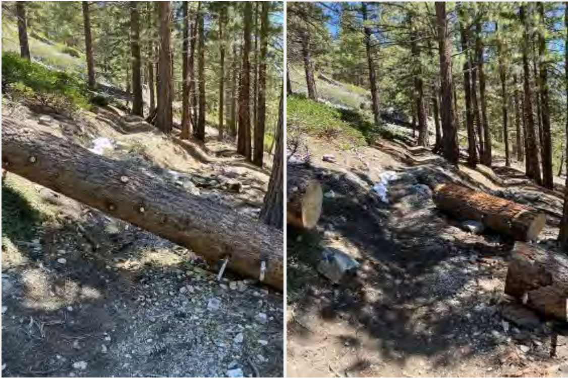
Sierra Canyon Trail-Before and after