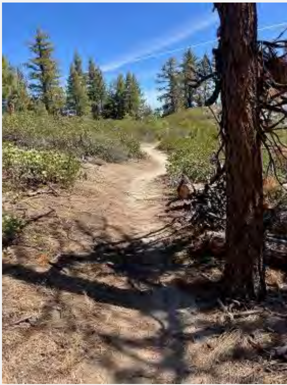
Clear Creek Trail-Before and after