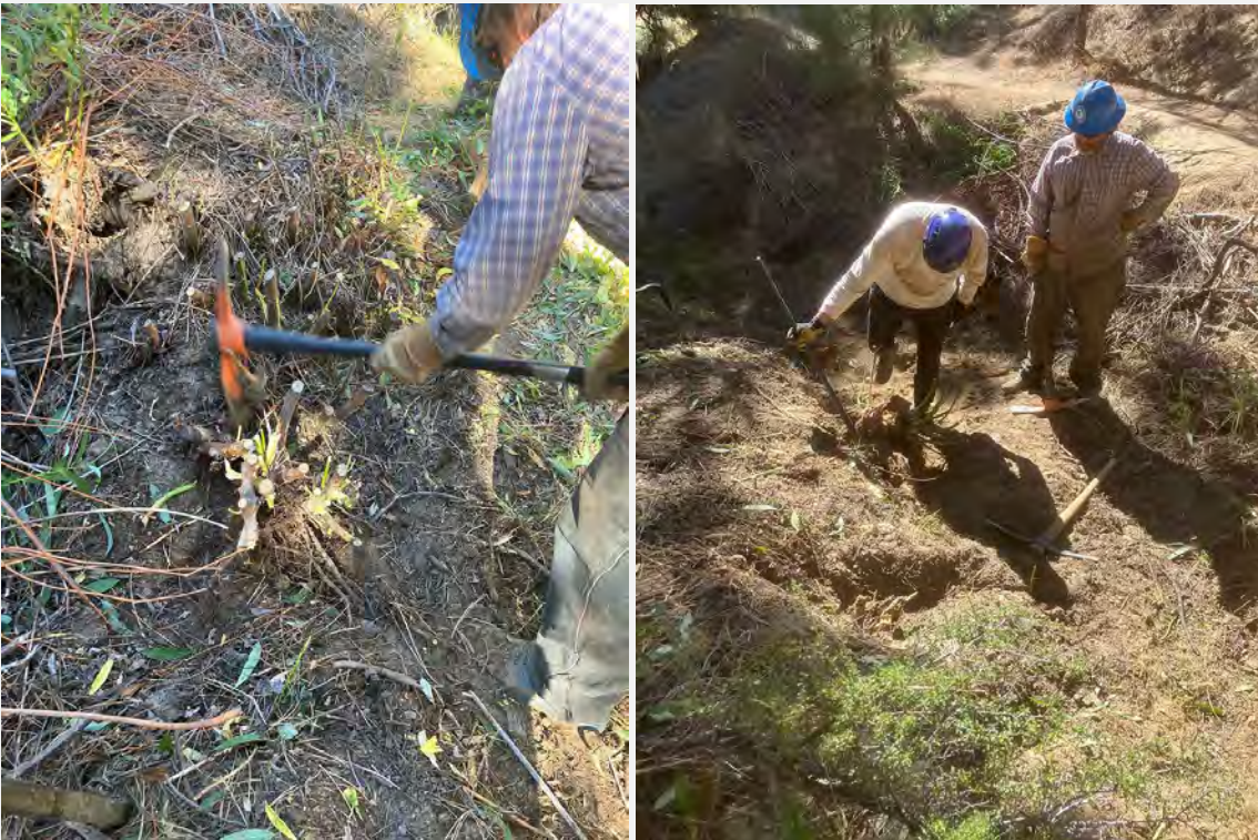
Willow root removal