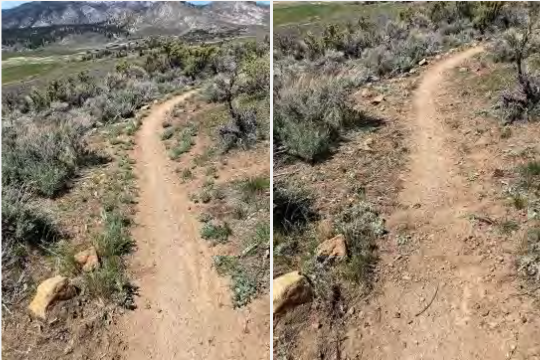
Lower Clear Creek Trail/Jacks Valley Loop-Before and after