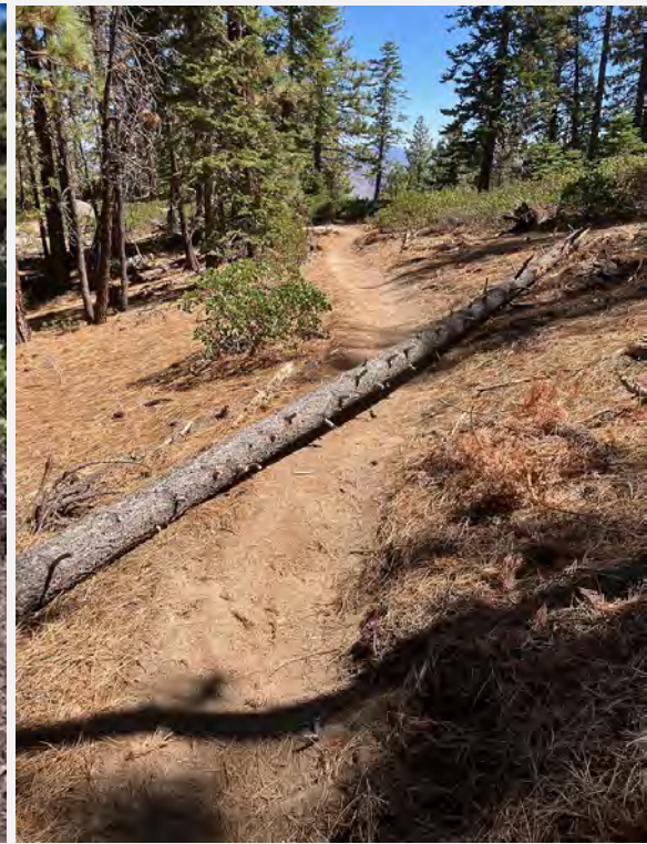
Clear Creek Trail