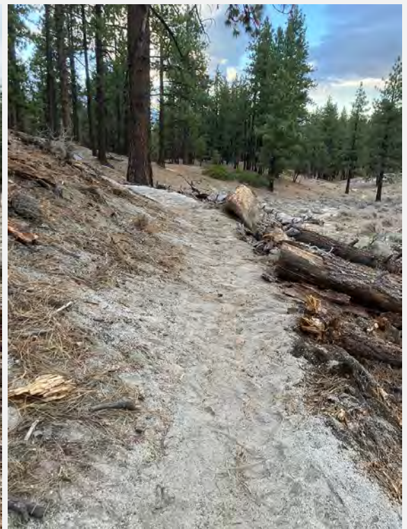
Jeffrey Pine Trail-Before and after