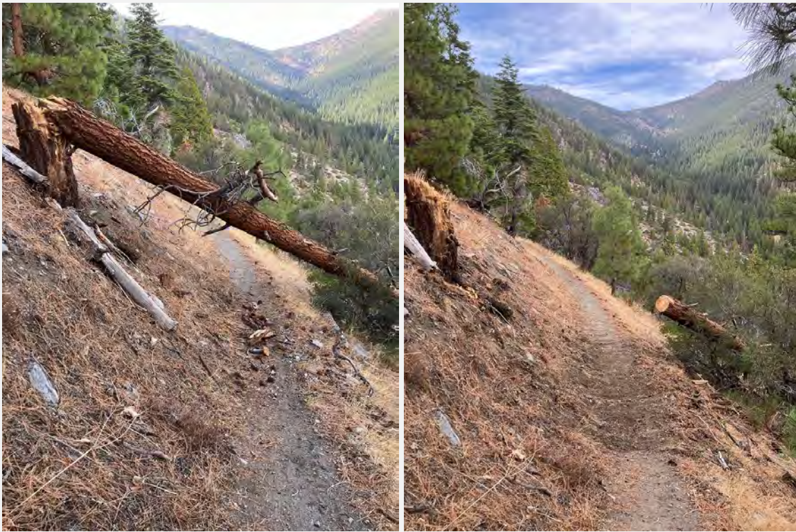
Genoa Loop-Before and after