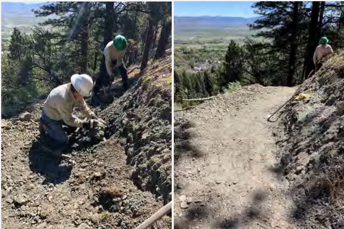
Trail widening-Before and after

4) A short section of trail was widened and sightline improved in lower Genoa Canyon.