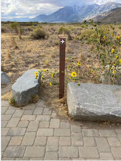
New directional arrows