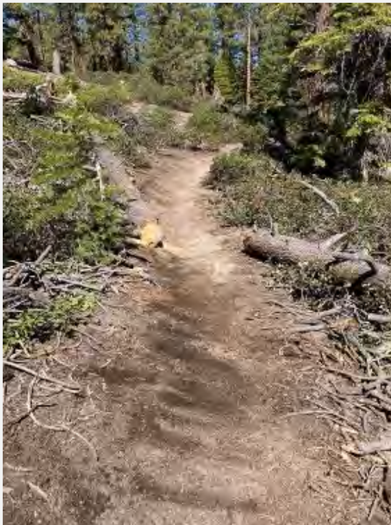
Clear Creek Trail-Before and after