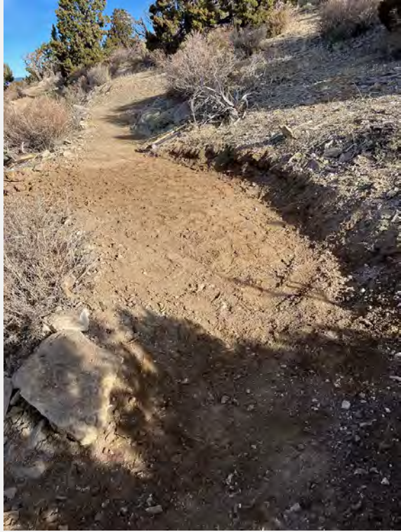
Rock removal before and after