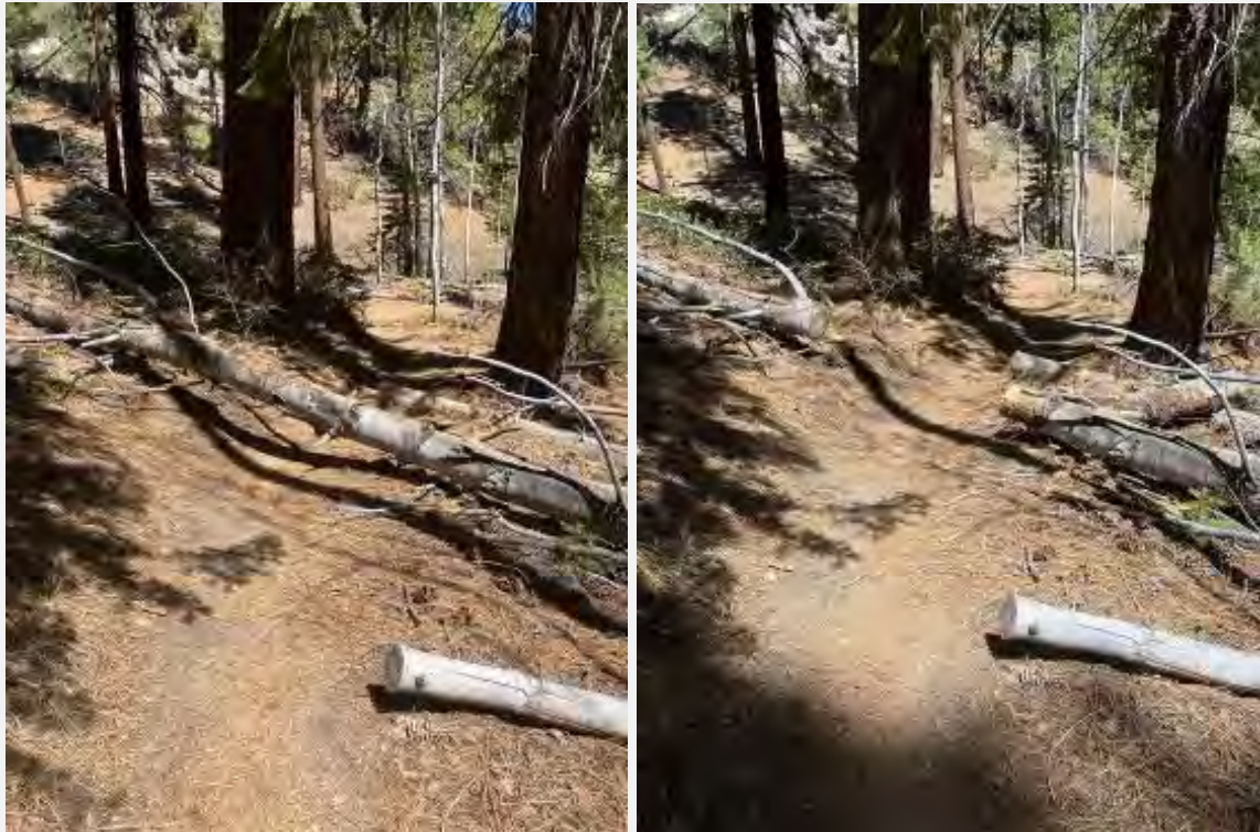
Clear Creek Trail-Before and after