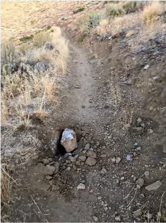
Rock removal-Clear Creek Trail/JV Loop