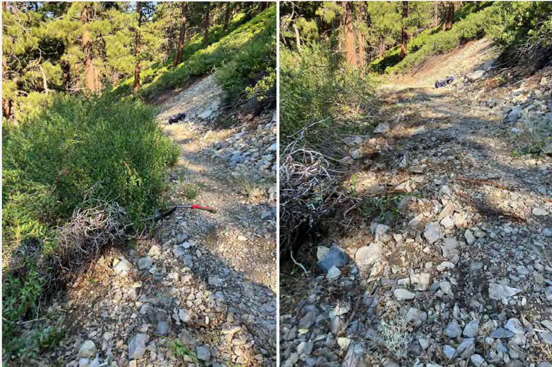
Brushing before and after

7) Nettles were removed in lower Genoa Canyon, roses removed from lower Sierra Canyon, and willows and roses removed from two areas above Eagle Ridge Trailhead.