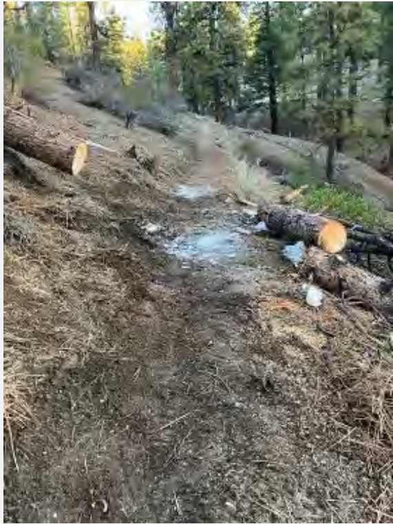
Clear Creek Trail-Before and after