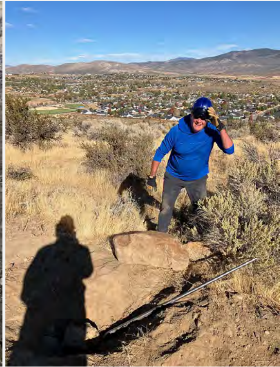
Rock removal-Jacks Valley Loop

2) Waterbars were cleaned out on the old road above the Jacks Valley Road TH to prevent damage to the trailhead area and IVGID sewer line.