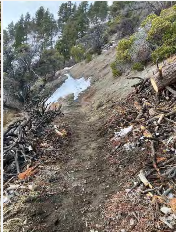
Genoa Loop-Before and after