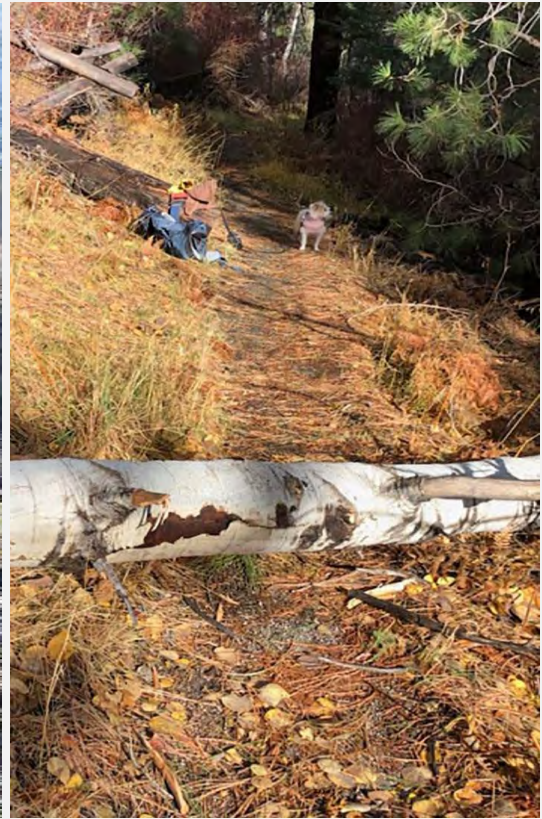
Fay-Luther/Jobs Peak Ranch Trail