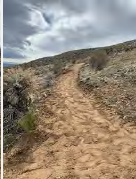
Tread widening-Lower Clear Creek Trail