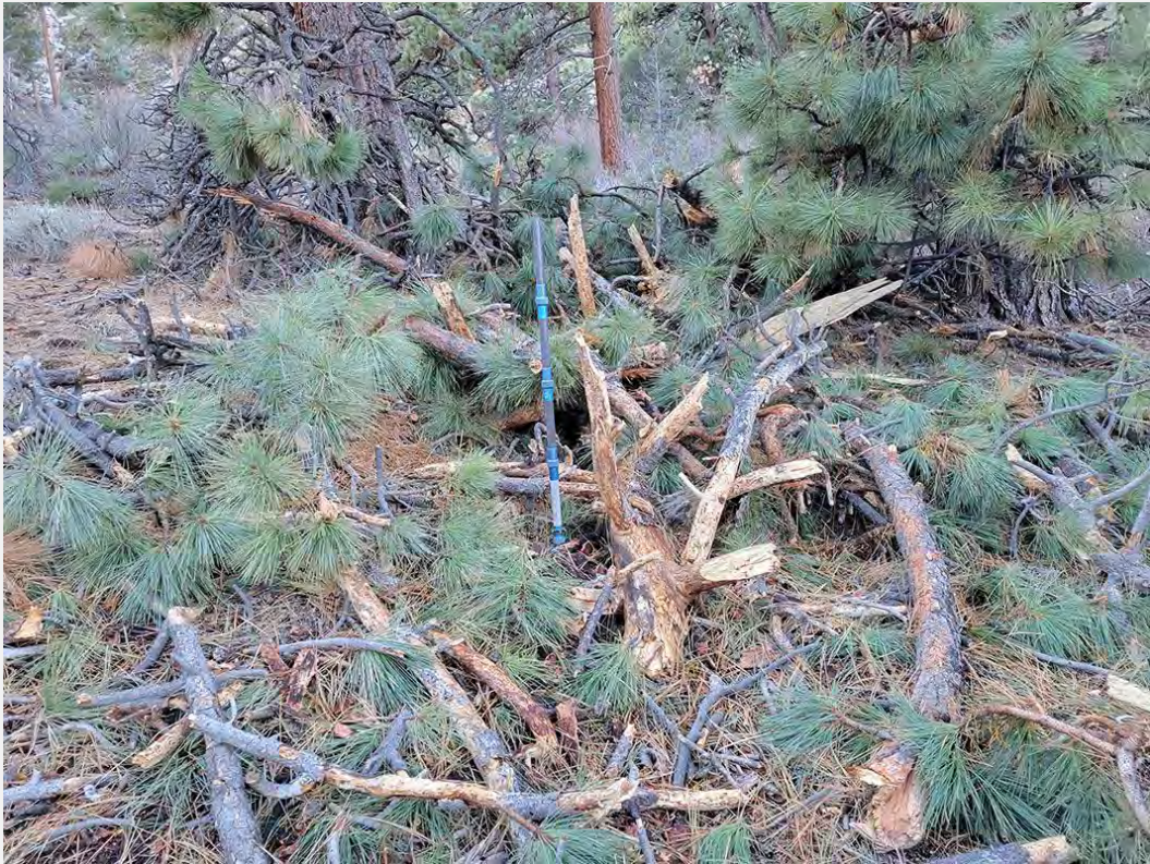
Fay-Luther/Jobs Peak Ranch Trail before