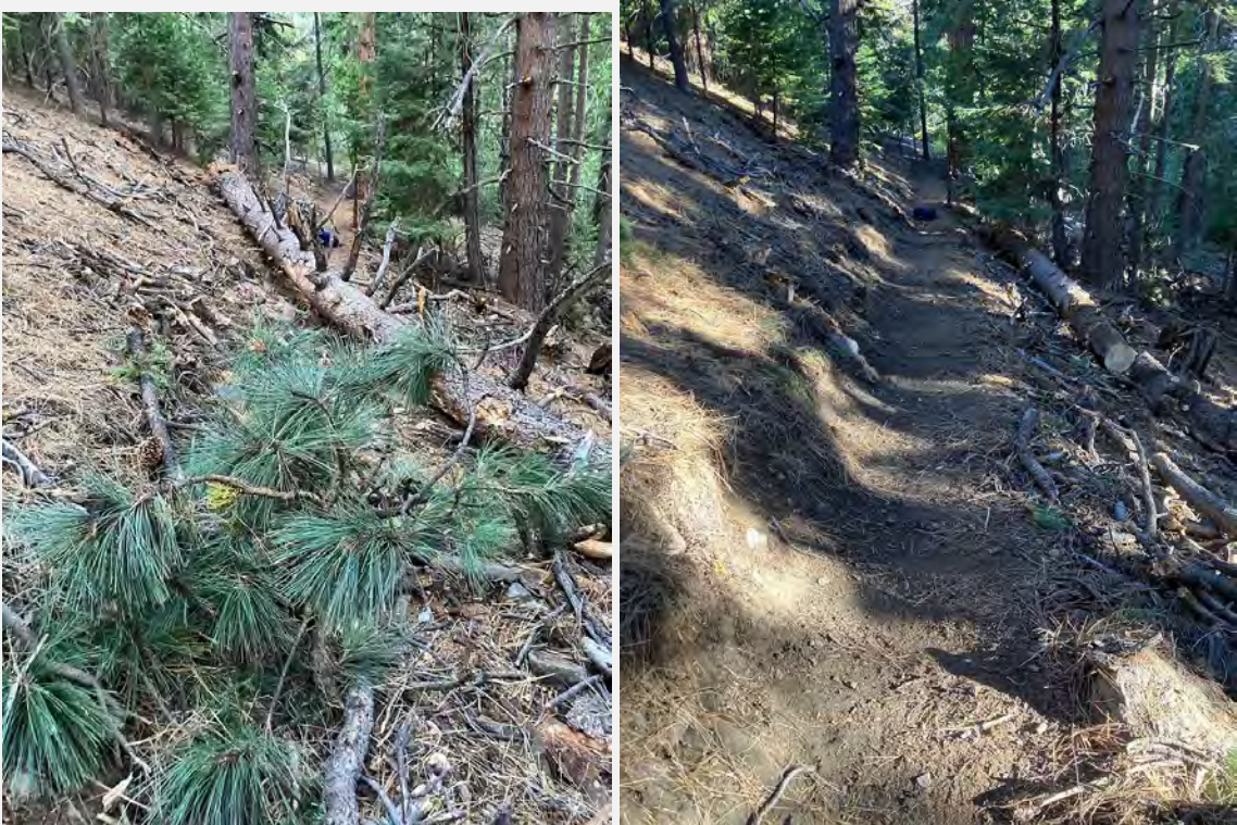
Genoa Loop-Before and after