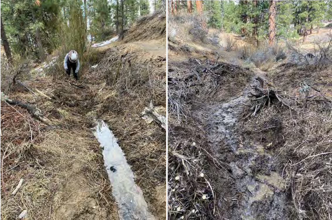
Willow root removal

3) The creek crossing below Jacks Valley Overlook had additional willows and roots removed to prevent ponding and trail damage. Rock steps were placed for hikers during higher flow.