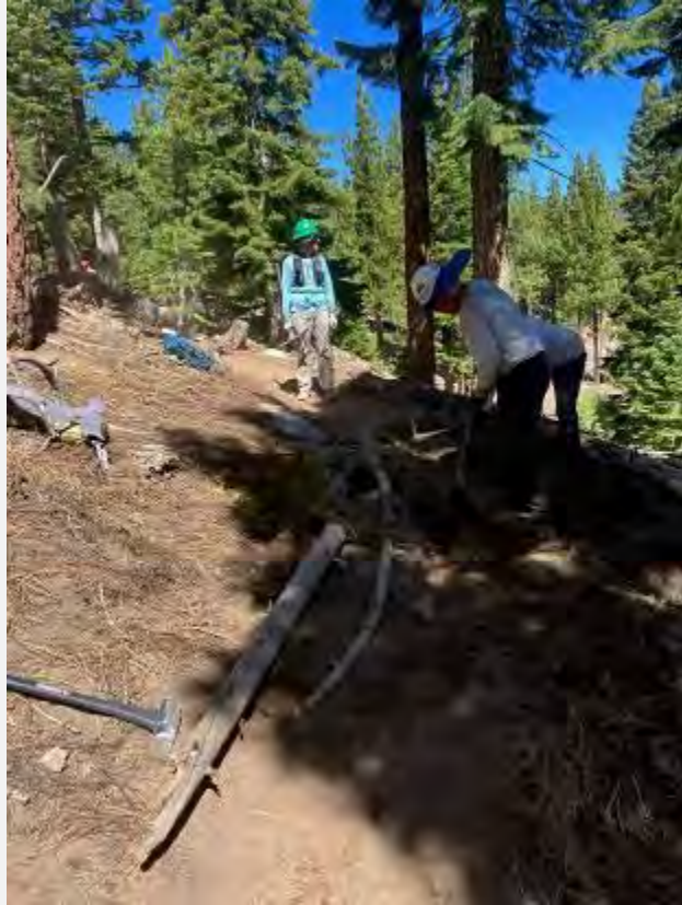
Realignment below boulders