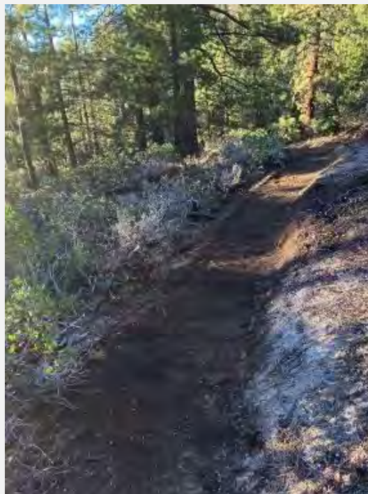
Climbing turn improved

6) A climbing turn was improved above Clear Creek Junction for better flow and sight.