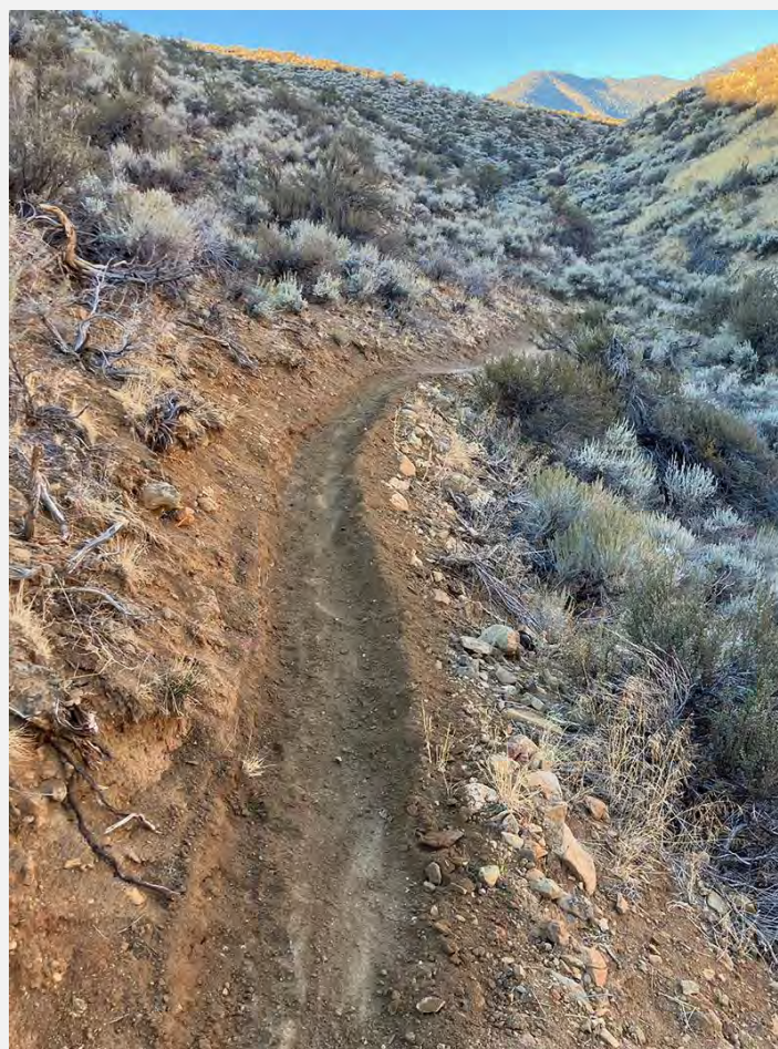
Trail widening-Clear Creek Trail/Jacks Valley Loop