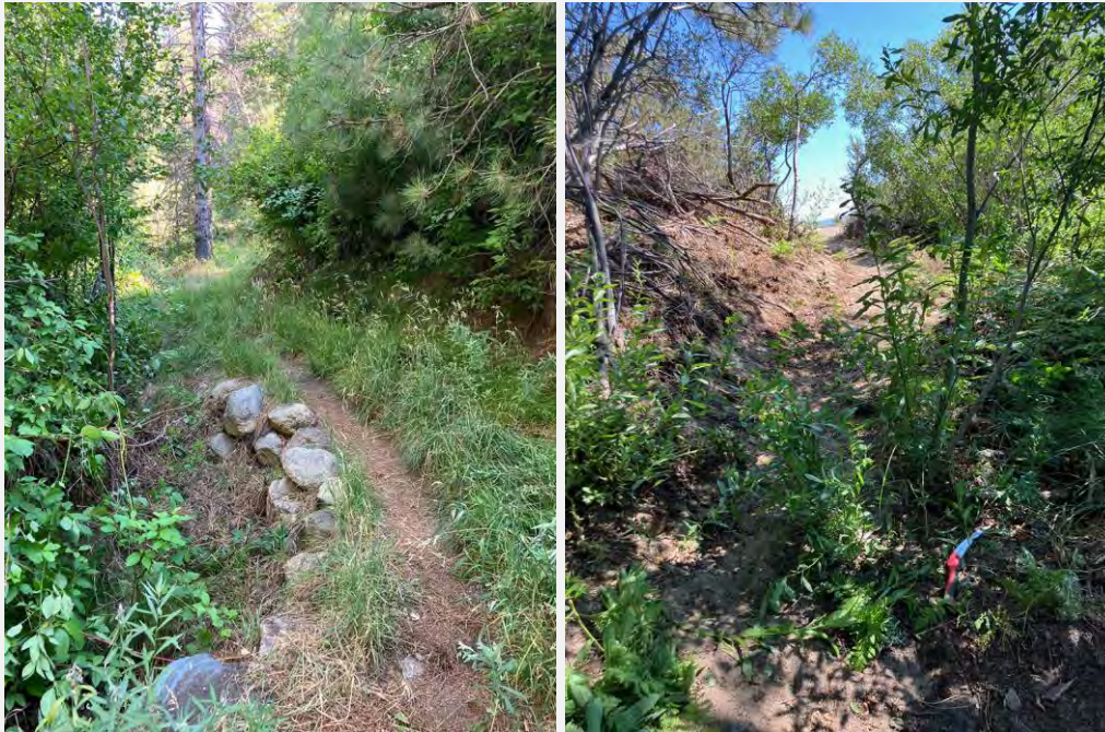
Riparian areas brushed out