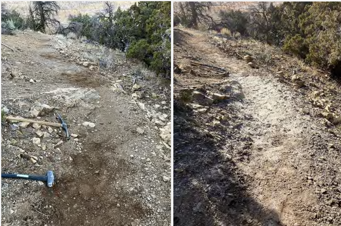
Rock removal before and after

2) Routine rock removal, brushing and tread maintenance was completed.