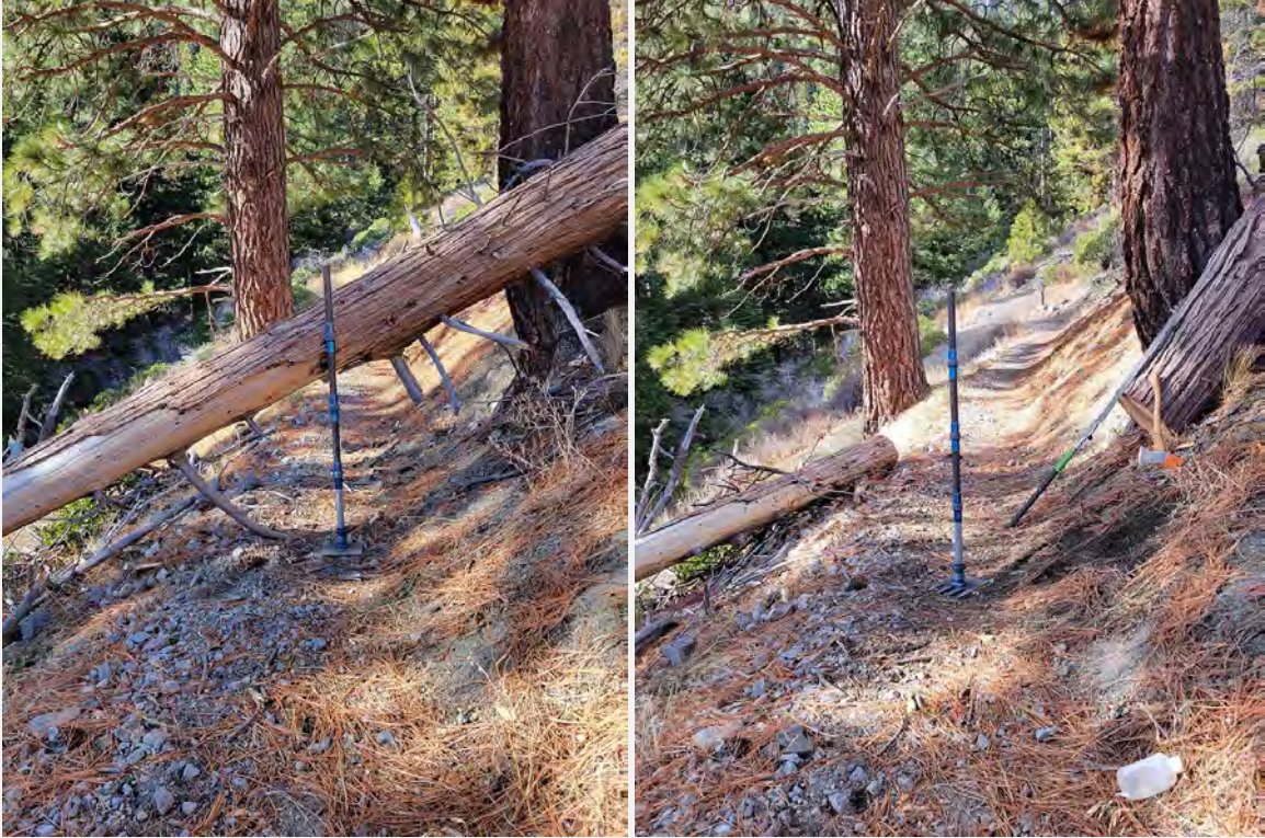
Sierra Canyon Trail/Eagle Ridge Loop-Before and after

1) Ten fallen trees were removed from the trail system.