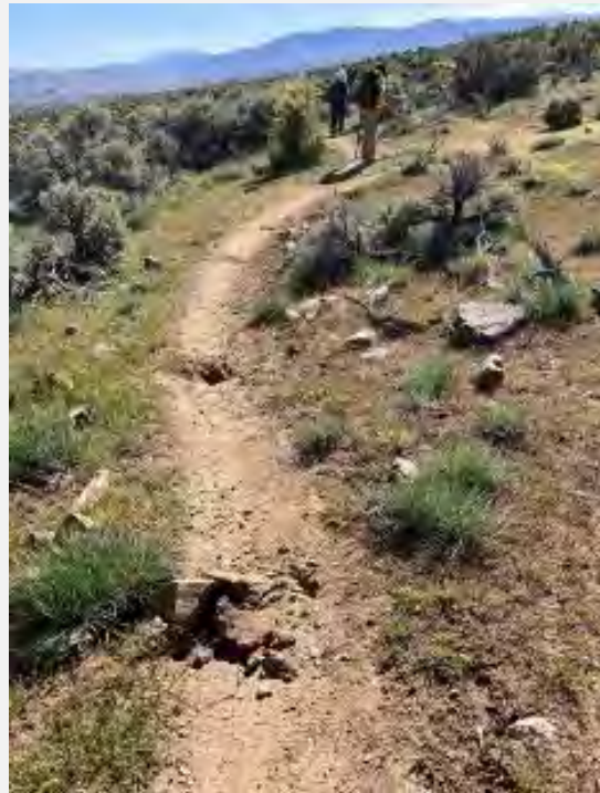
Rock removal-Jacks Valley Loop