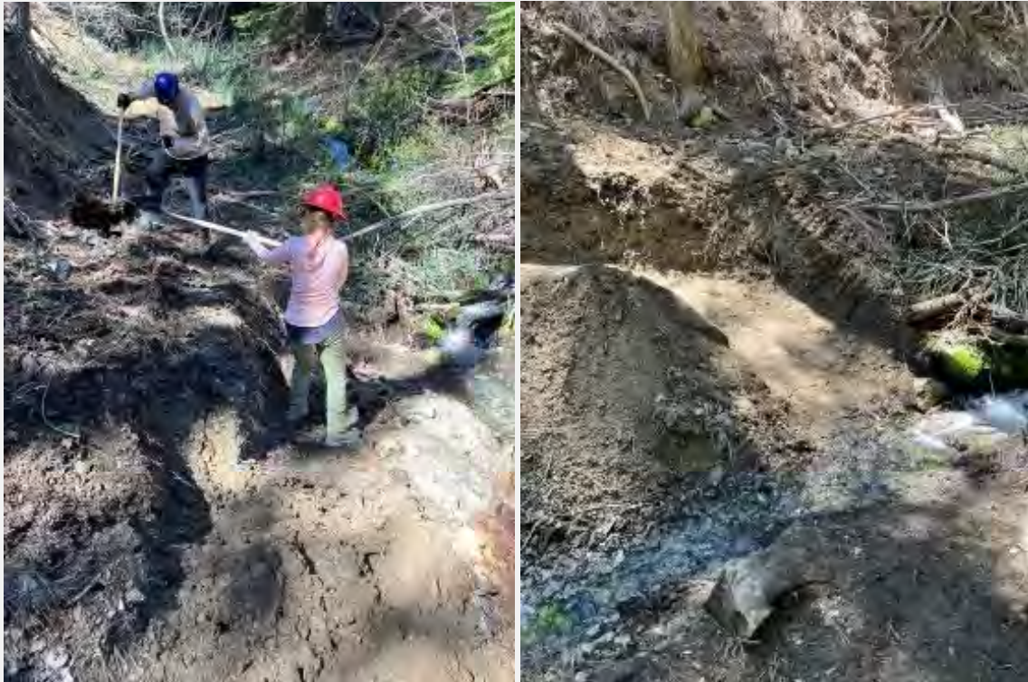
Trail widening-Before and after

3) The east approach into South Fork Genoa Creek was widened for better trail flow and safety.