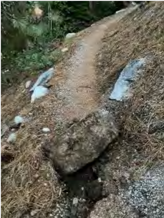
Rock removal-Clear Creek Trail