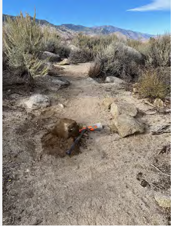
Rocks removed-FLJPR Trail