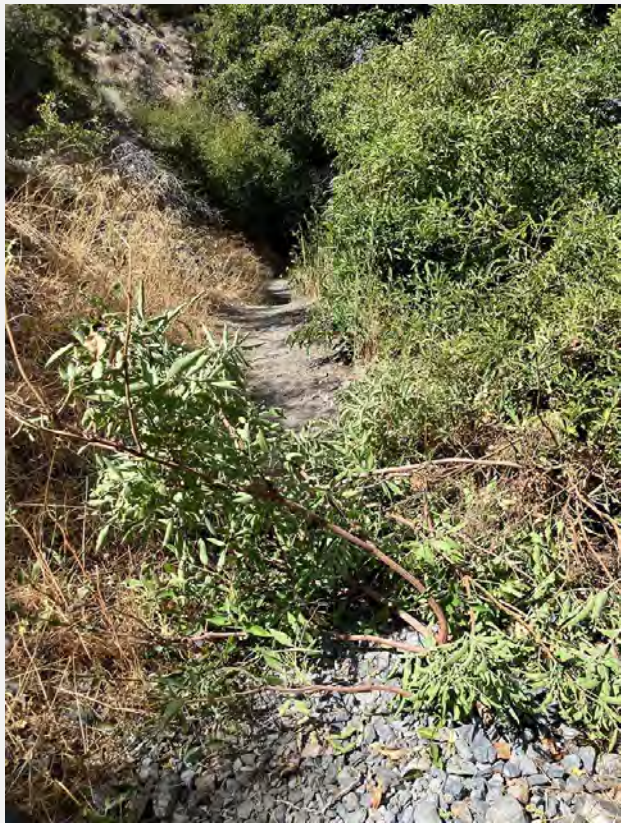
Willows and roses removed

8) Heavy brush removal occurred on the lower 1.8 miles of the Sierra Canyon Trail.