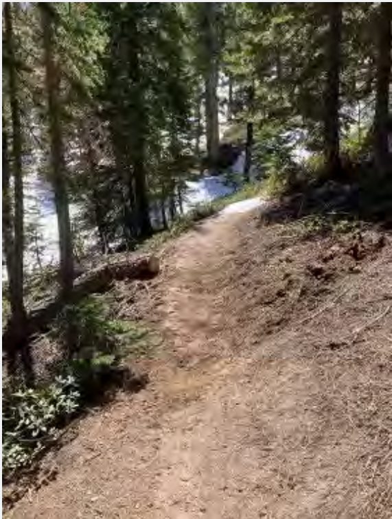
Clear Creek Trail-Before and after