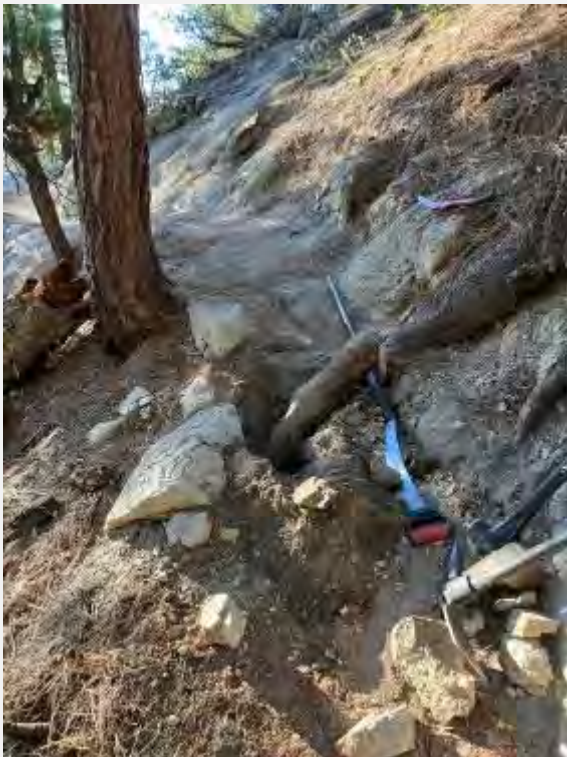
Root removal-Clear Creek Trail