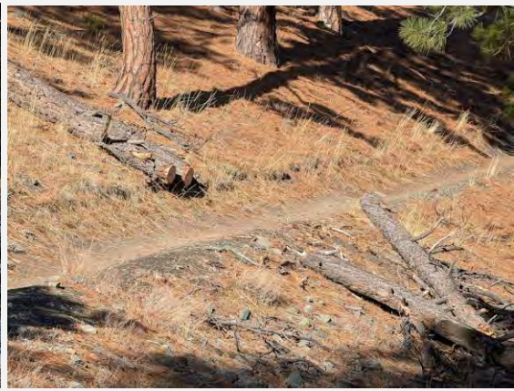
Sierra Canyon Trail-Before and after