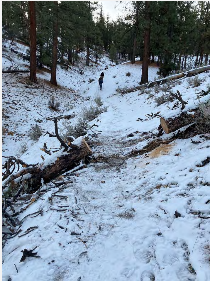
Interpretive Loop after