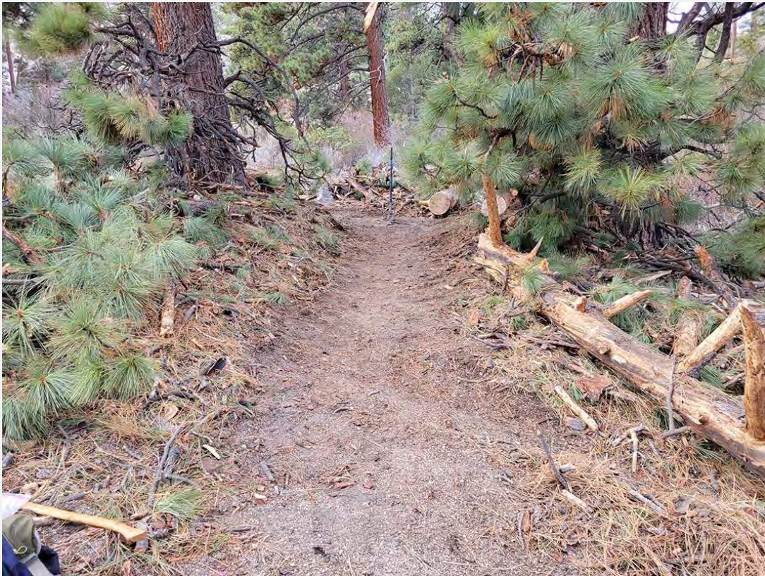
Fay-Luther/Jobs Peak Ranch Trail after