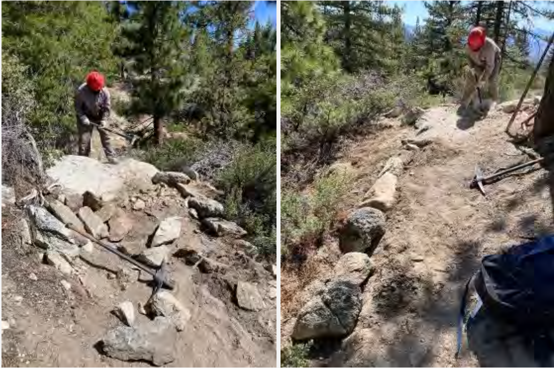
Tread widening and rock removal