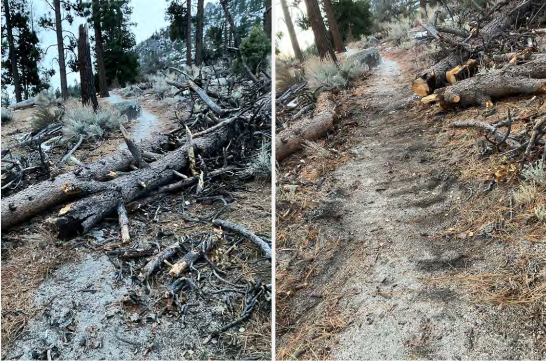
Fay-Luther/Jobs Peak Ranch Trail-Before and after

2) Eleven fallen trees were removed from the trail system.