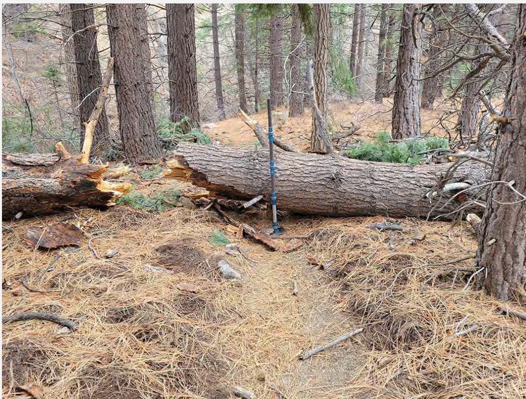
Interpretive Loop before