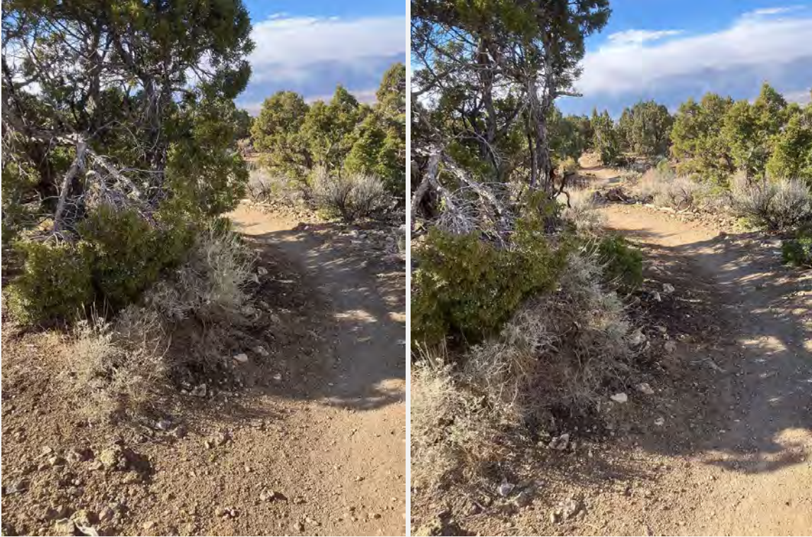
Branch limbing before and after

3) Branches were cut back where needed to improve sightlines.