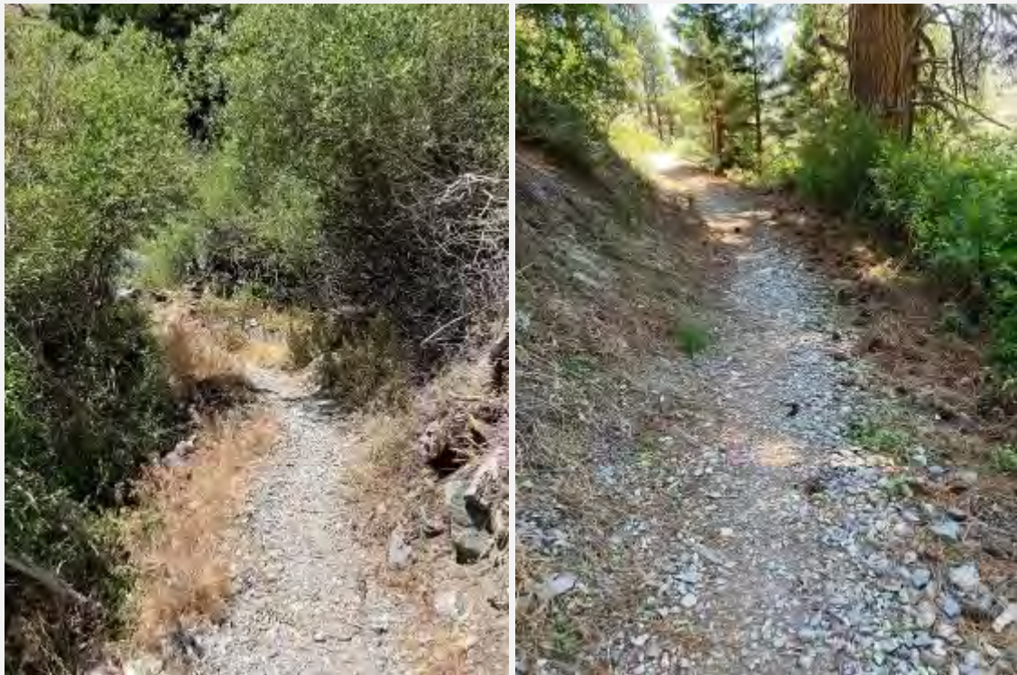
Willows and roses removed

7) Nettles were removed in lower Genoa Canyon, roses removed from lower Sierra Canyon, and willows and roses removed from two areas above Eagle Ridge Trailhead.