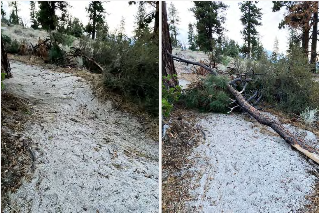
Fay-Luther/Jobs Peak Ranch Trail-Before and after