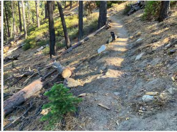
Clear Creek Connector-Before and after