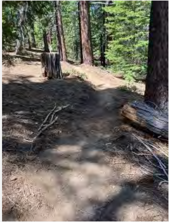
Clear Creek Trail-Before and after