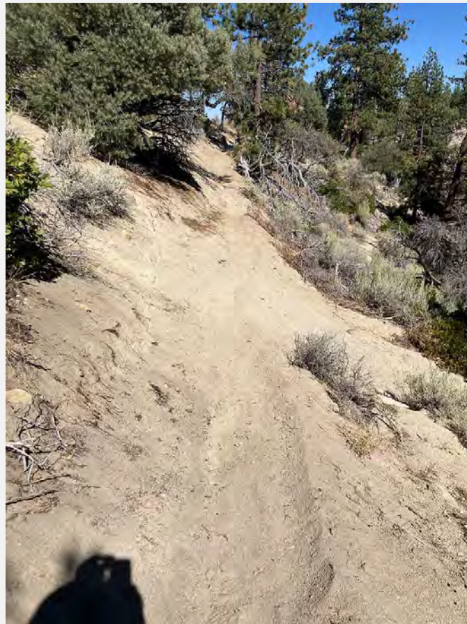
Rock chiseling and benching-Appaloosa Trail