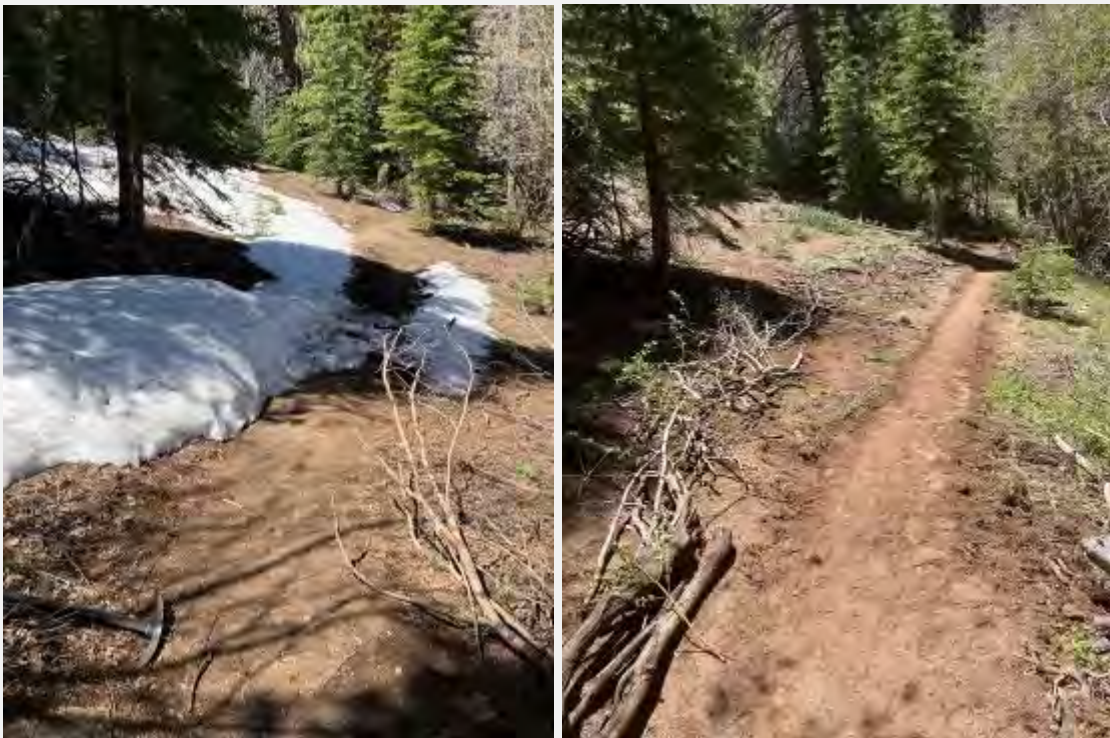
Realignment before and after