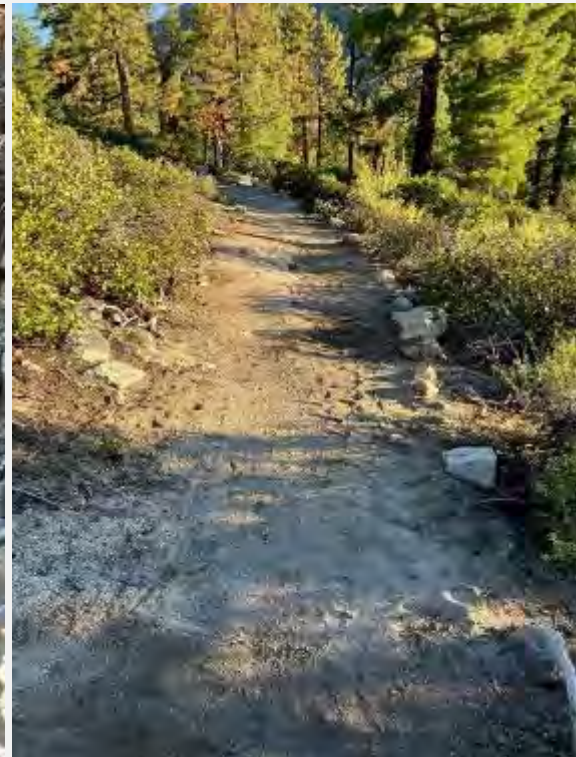
Slickrock removal-Clear Creek Trail