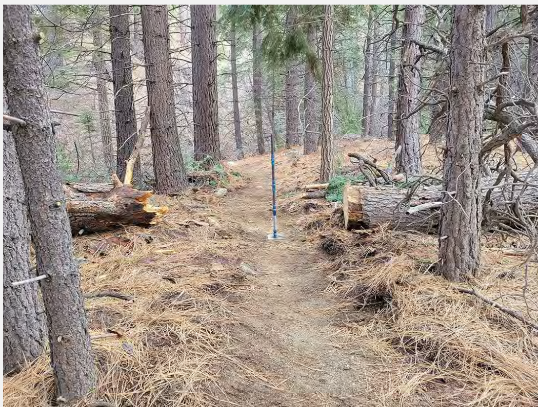
Interpretive Loop after