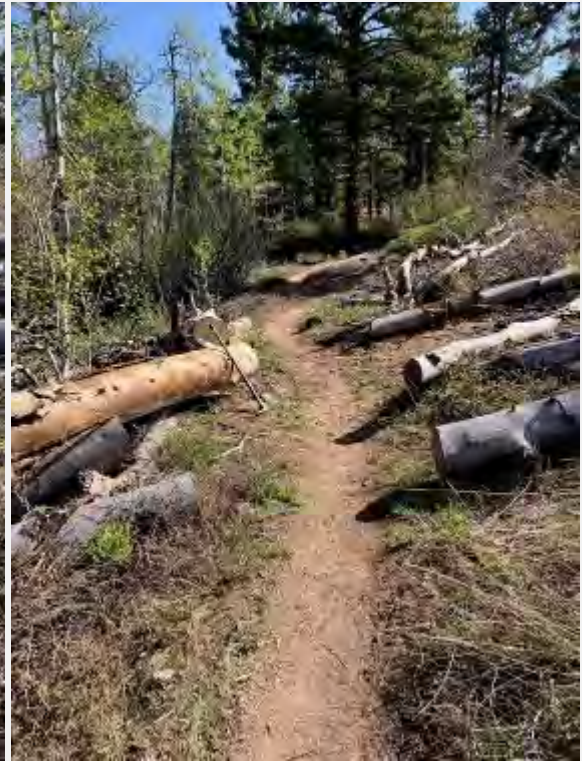
Clear Creek Trail-Before and after