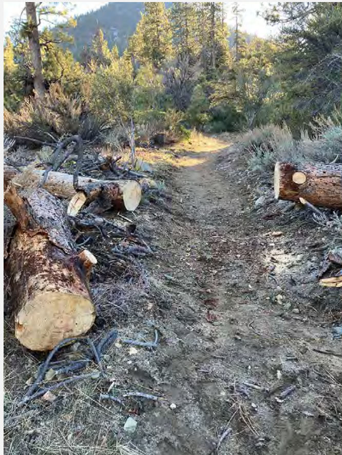
Grand View Loop