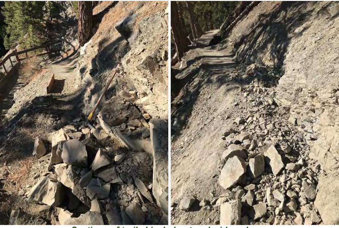
Sections of trail chiseled out and widened

7) Three trail sections in Genoa Canyon were widened for bike and equestrian safety.