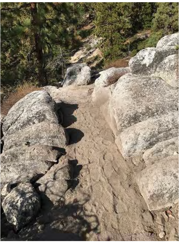
Rocky section improved

11) Routine maintenance was completed on the entire Clear Creek Trail, Clear Creek Connector Trail and Jacks Valley Loop including brushing, widening and tread cleanup.