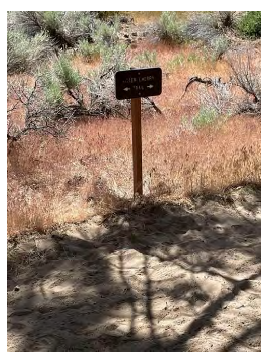
Sign post reinstalled

2) The Bitter Cherry trail sign post was broken and reinstalled.