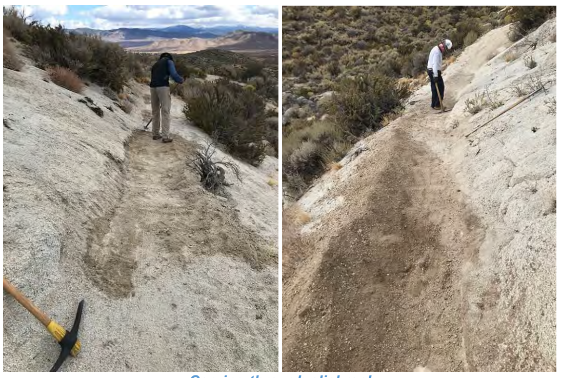
Carving through slickrock

13) A 100-foot slickrock area was chiseled and widened above Jacks Valley Road for user safety.