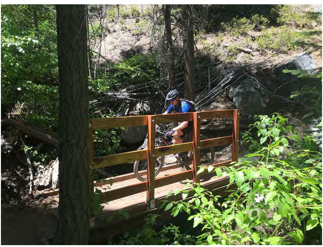
Bridge railing installed