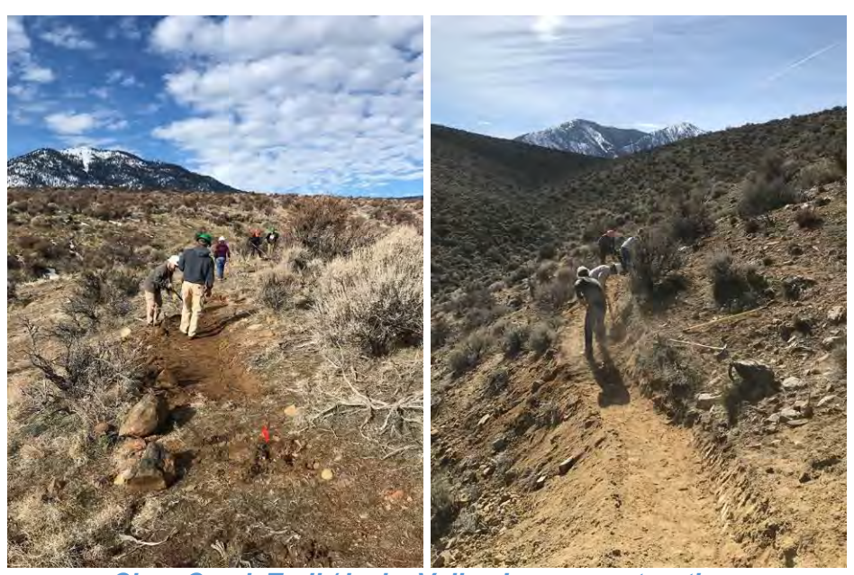
Clear Creek Trail /Jacks Valley Loop construction