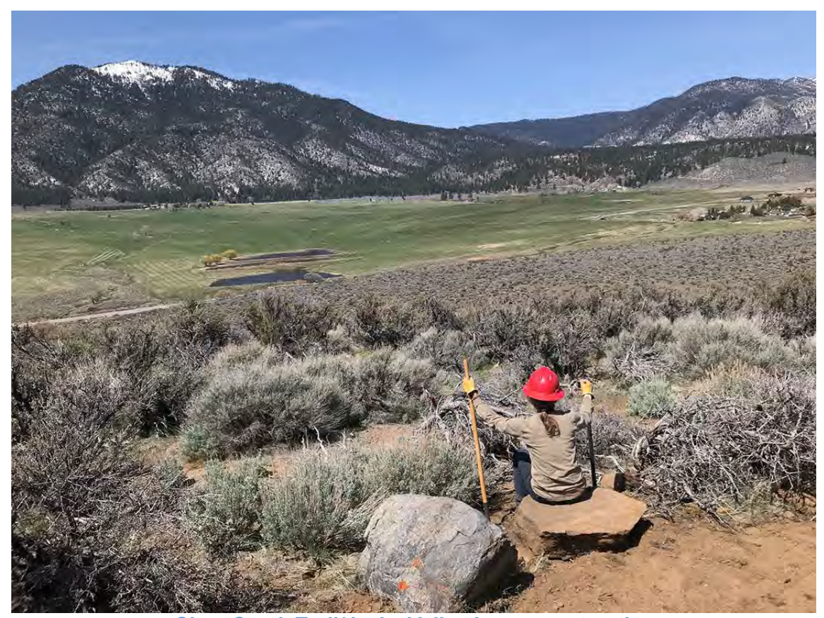
Clear Creek Trail/Jacks Valley Loop construction