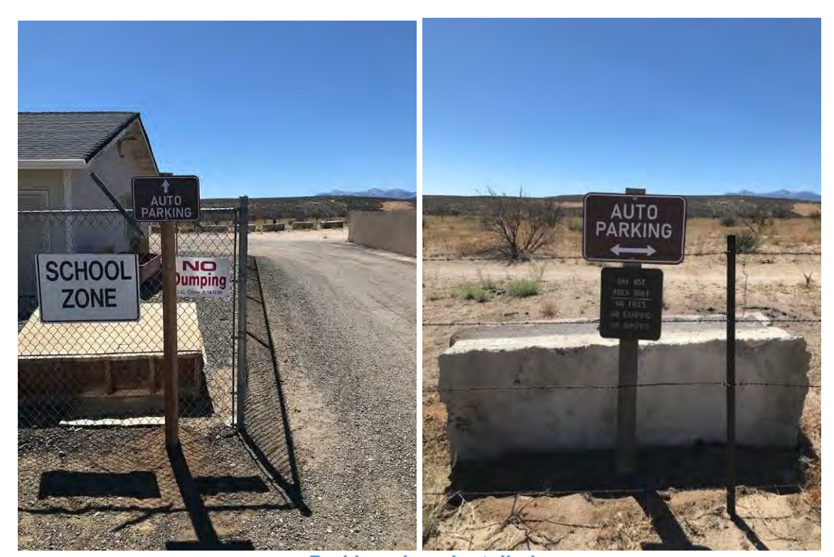
Parking signs installed

9) Five directional parking signs were installed at the Jacks Valley School Trailhead to help delineate auto and horse trailer parking locations.