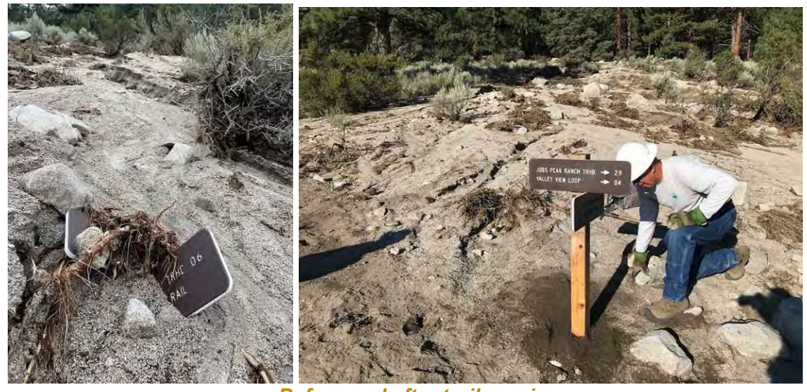
Before and after trail repairs