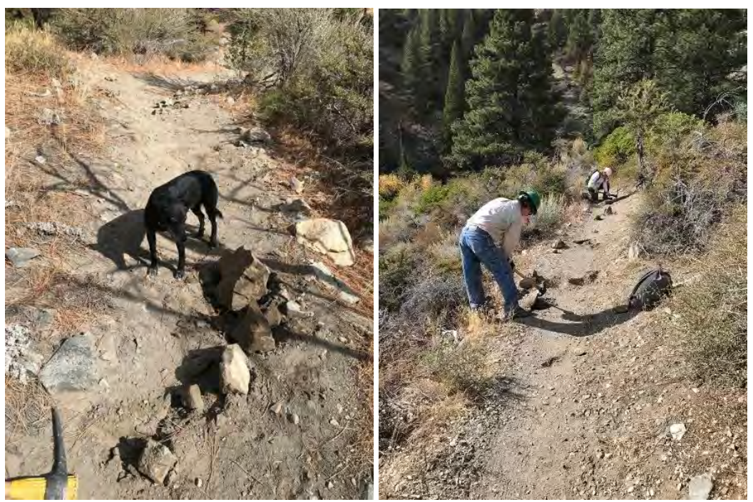
Rock obstacles removed from trail

9) The lower two miles of the Sierra Canyon Trail had dozens of protruding rocks removed.