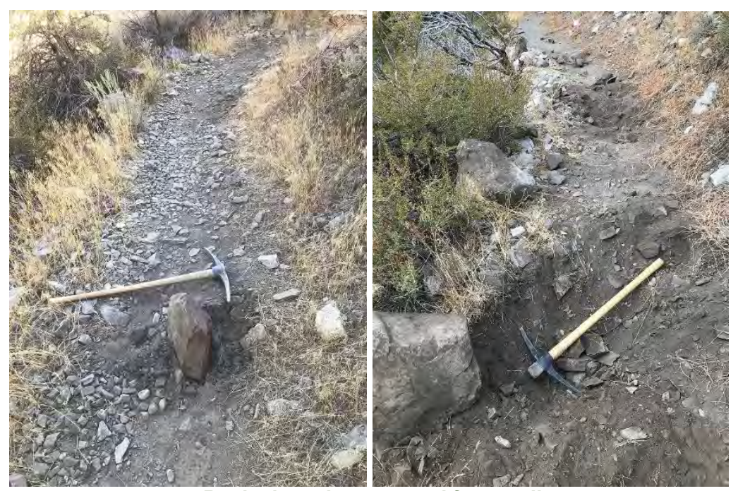
Rock obstacles removed from trail

8) The first mile of trail from Eagle Ridge TH had dozens of embedded, protruding rocks removed.