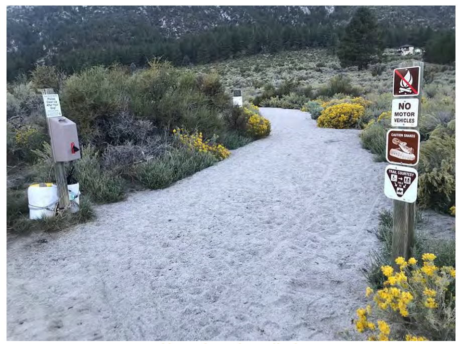
New signs installed

6) The trailhead area was brushed out and new signage post installed.