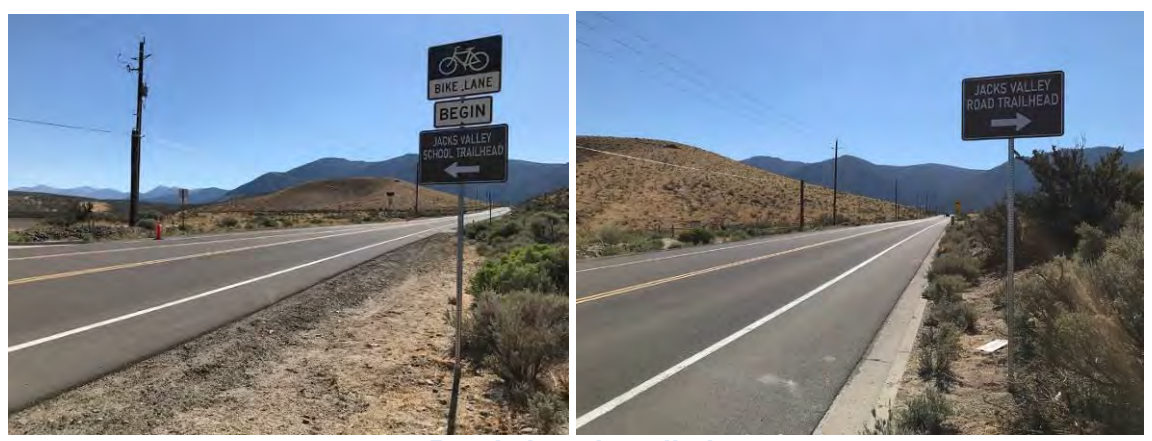
Road signs installed

10) Roadside trailhead signs were installed along Jacks Valley Road to help new users locate the Jacks Valley Road and Jacks Valley School Trailhead locations.