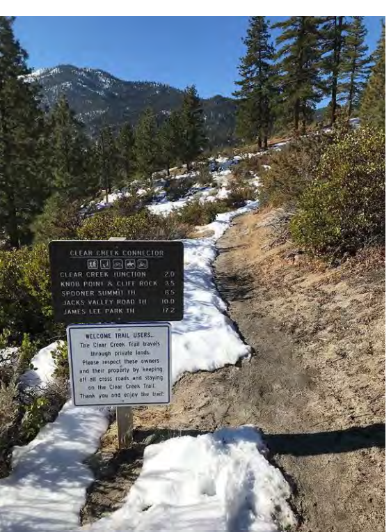
Jacks Valley School Trailhead