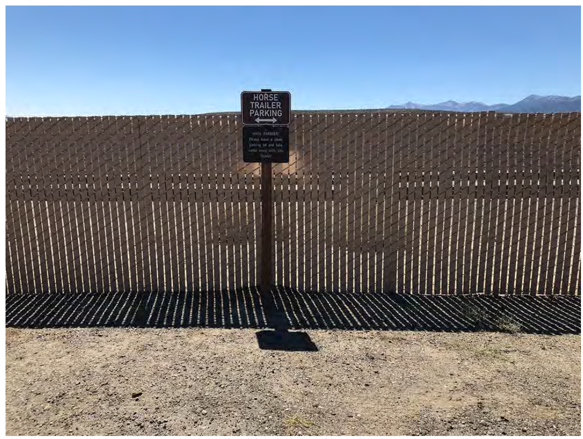
Parking signs installed

10) Roadside trailhead signs were installed along Jacks Valley Road to help new users locate the Jacks Valley Road and Jacks Valley School Trailhead locations.