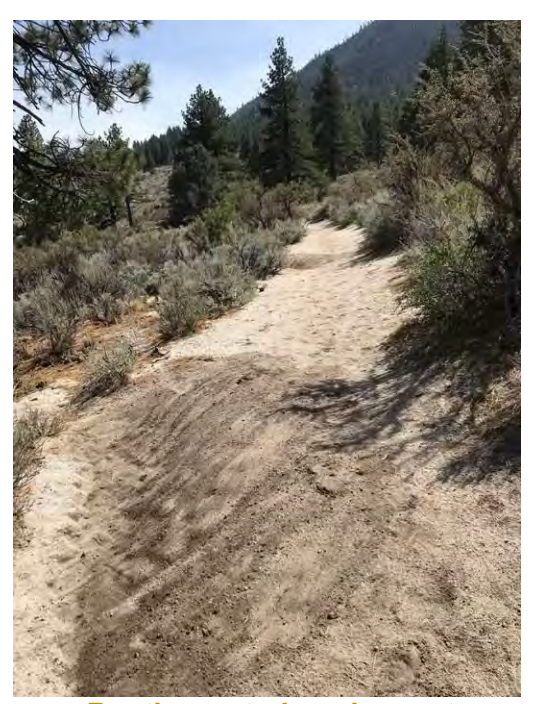
Routine waterbar cleanout

1) Most of the trail system had routine brushing, waterbar and tread maintenance completed twice.