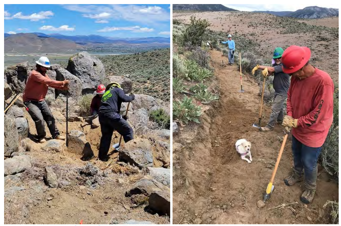
Clear Creek Trail/Jacks Valley Loop construction