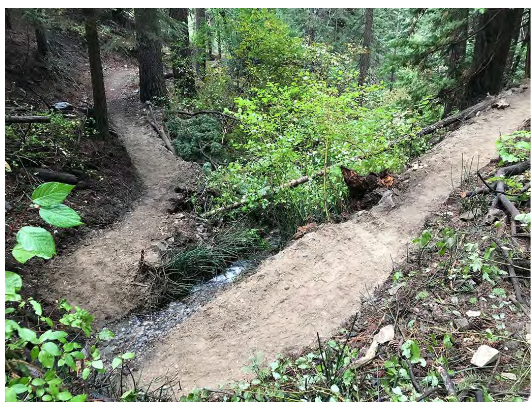
Creek crossing realignment

6) An 80-foot realignment was built across the South Fork crossing of Genoa Creek.