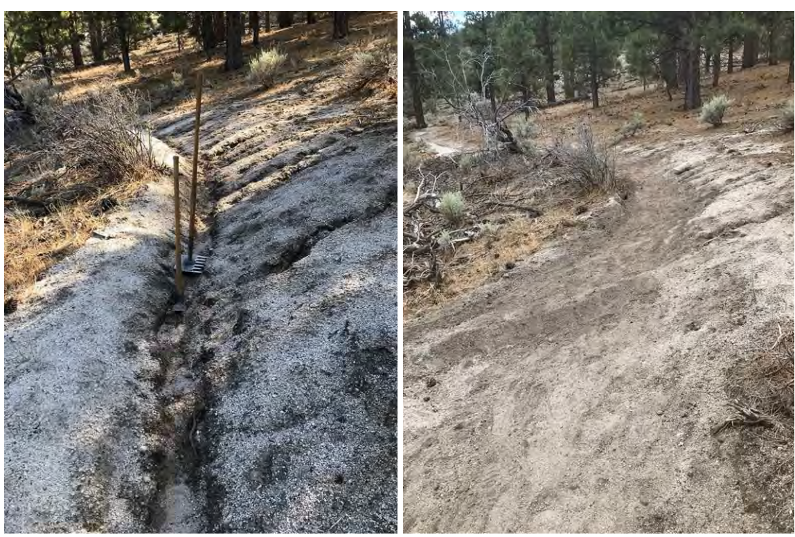
Before and after trail repairs