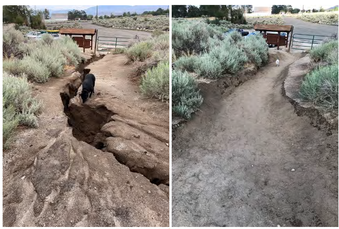
Before and after trail repairs

4) Heavy rains and mudslides caused damage on much of the old road portions of the trail system. These were all repaired.