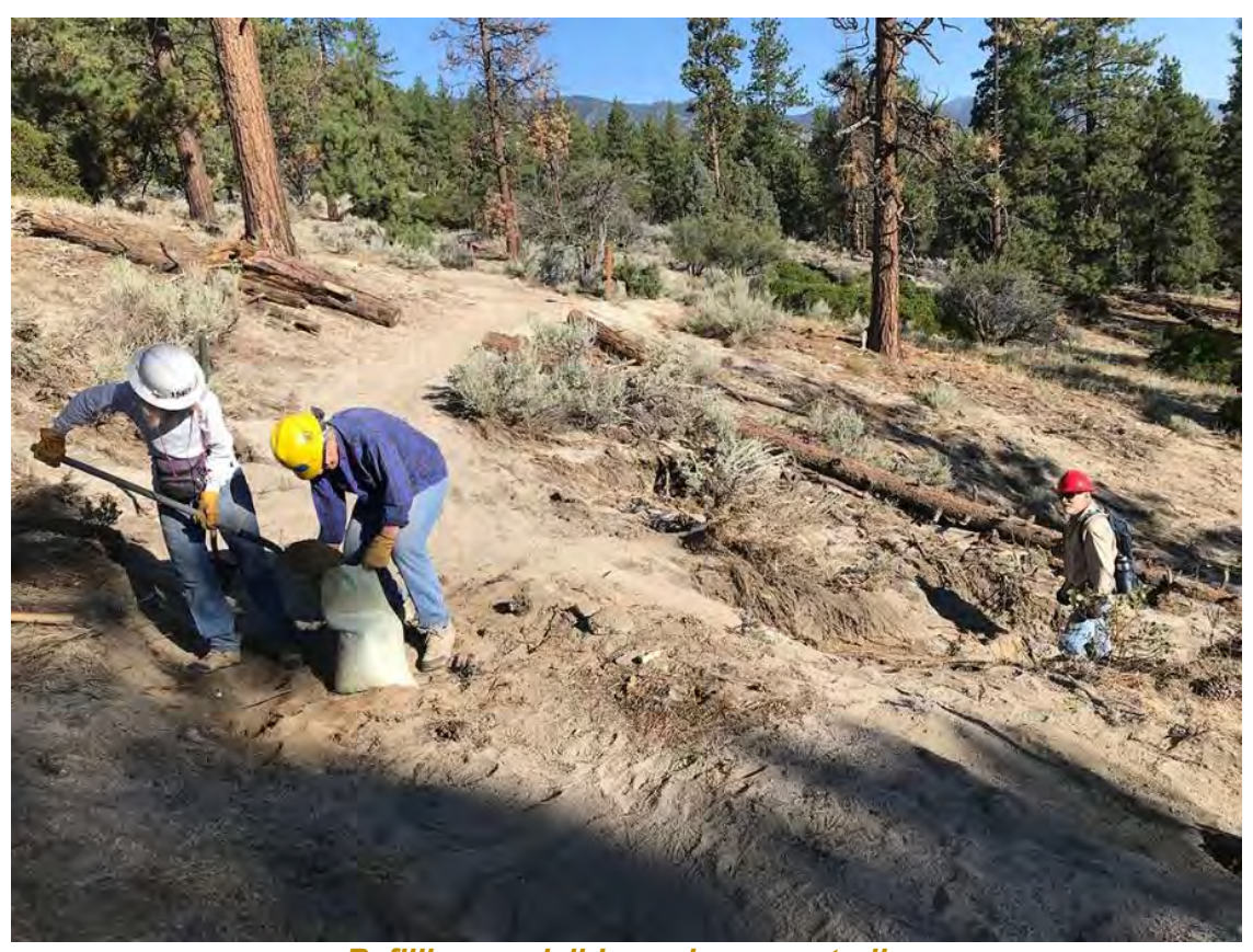
Refilling mudslide gash across trail