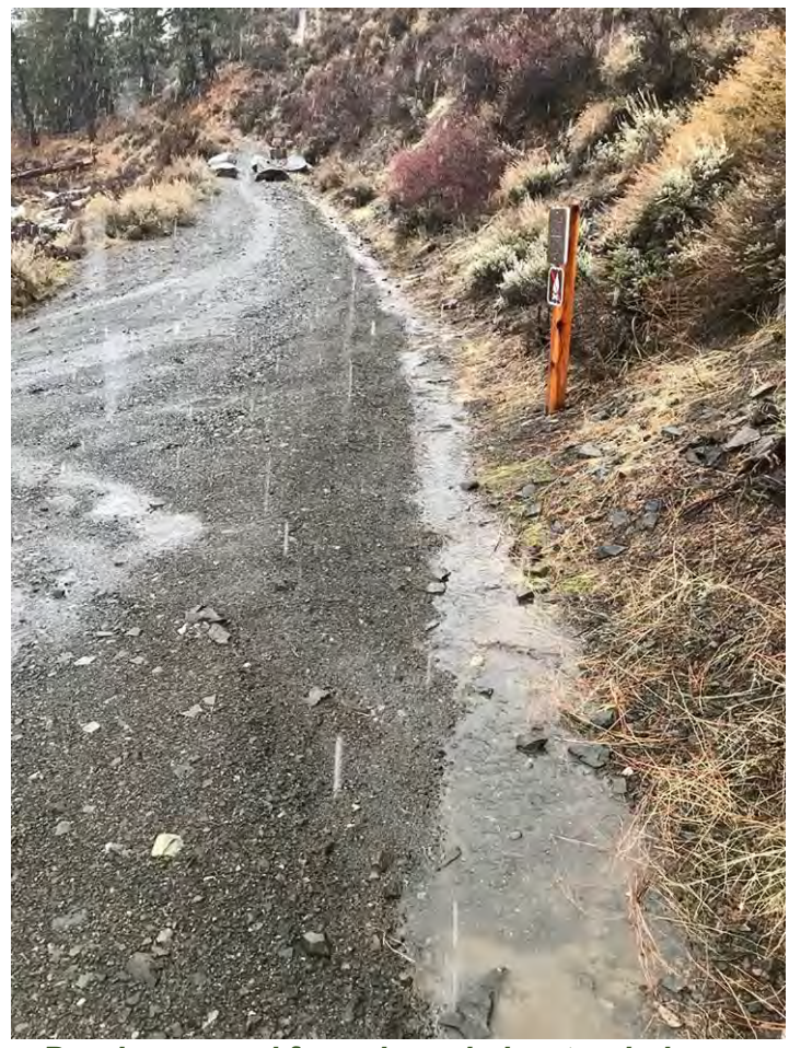
Brush removed for unimpeded water drainage

12) Updated kiosk signage was installed at the Eagle Ridge, Sierra Canyon and Genoa Canyon Trailheads.