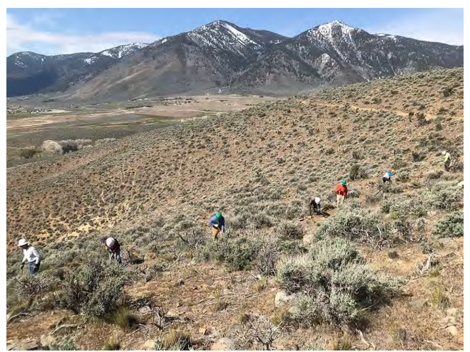
Clear Creek Trail/Jacks Valley Loop construction

1) The lower nine miles of the Clear Creek Trail and the overlapping Jacks Valley Loop were constructed this year.