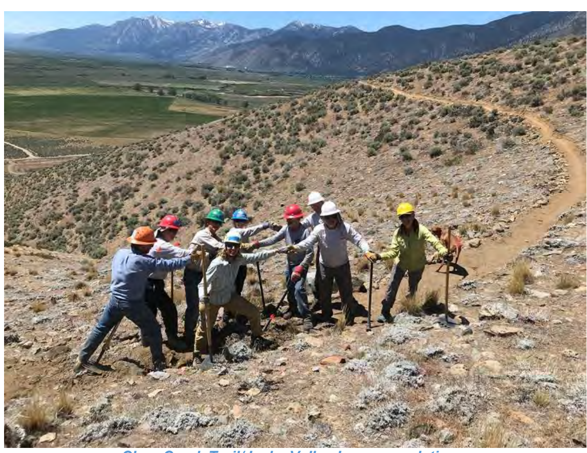
Clear Creek Trail/Jacks Valley Loop completion