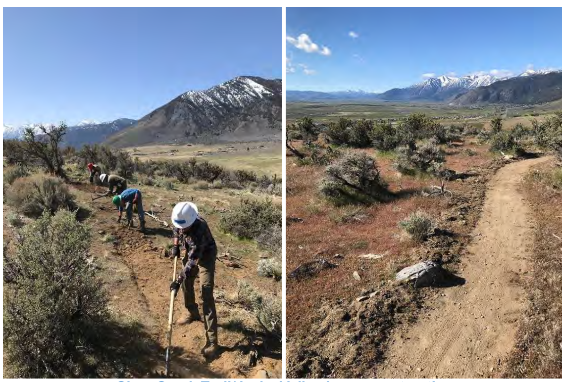
Clear Creek Trail/Jacks Valley Loop construction