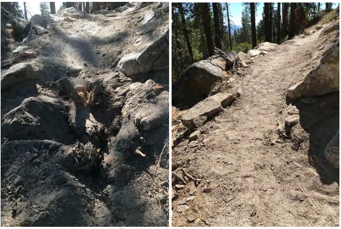
Rooty section improved