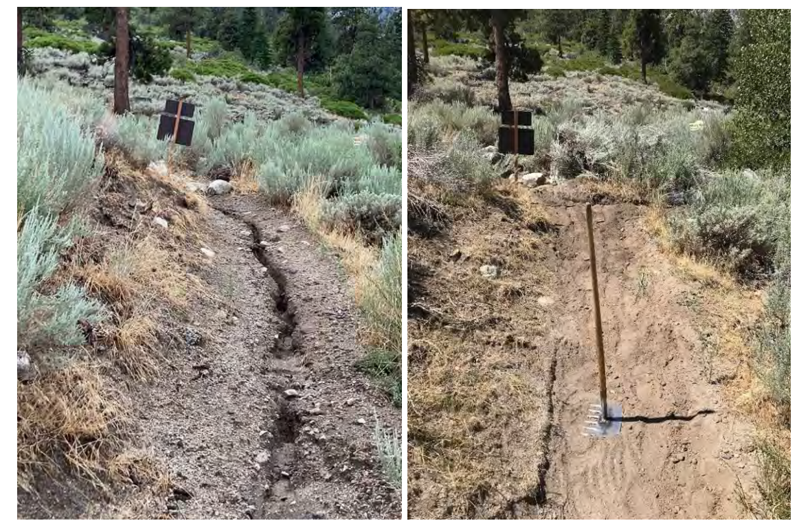
Before and after trail repairs