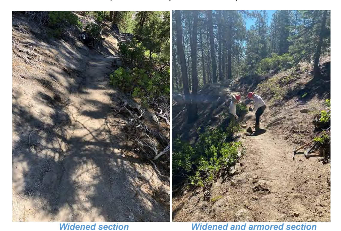
7) A bridge railing was installed on the downhill side of the upper Clear Creek bridge to improve the safety of all trail users.

6) Two sections of trail were heavily widened and armored between Clear Creek Junction and Cliff Rock to improve the safety of bikers and equestrians.