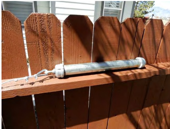
New weight and attached eye bolt, thimble and clamps