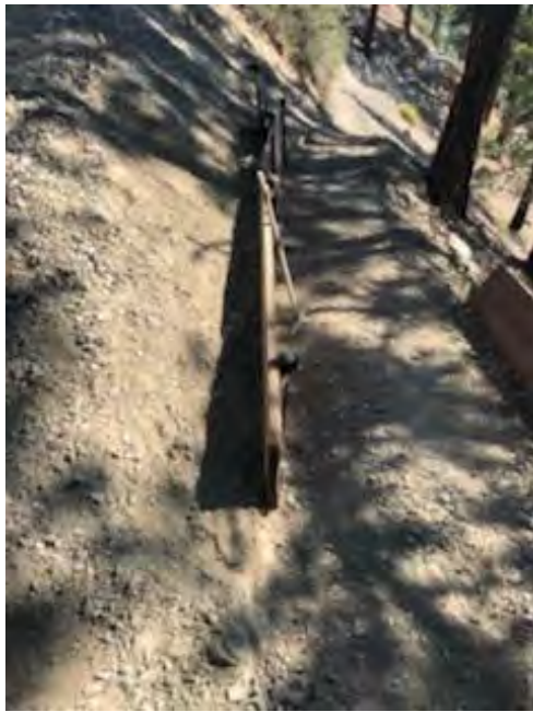
Retaining wall cleaned