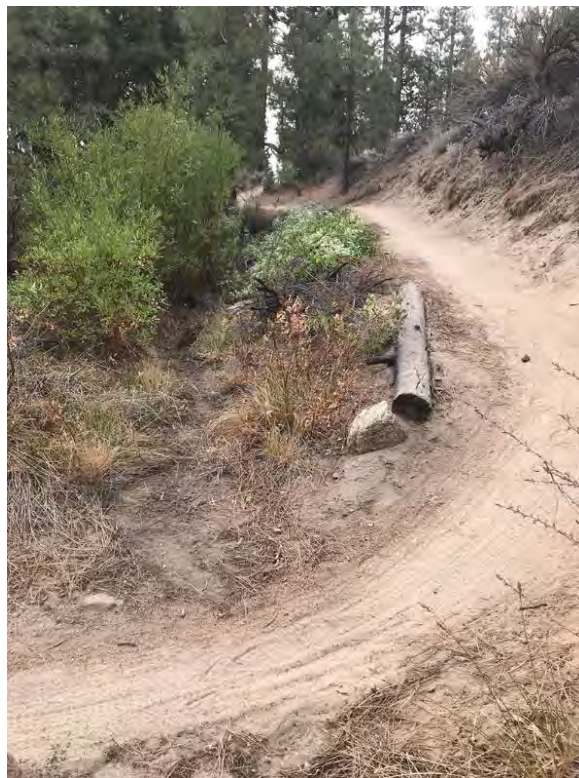
Willows cut back