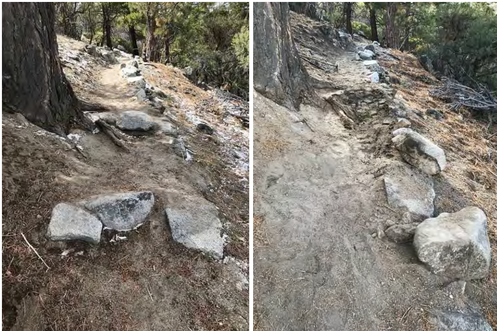
Tread widening and armoring Grand View Loop