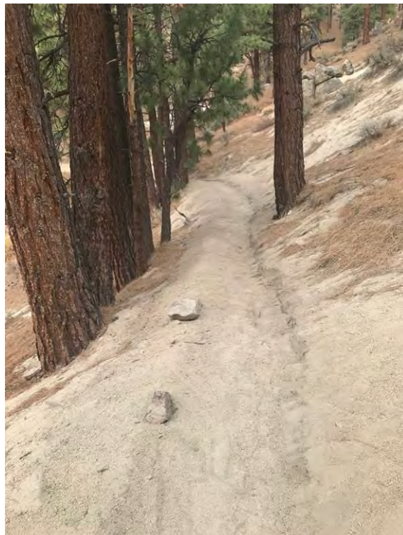
Trail section improved