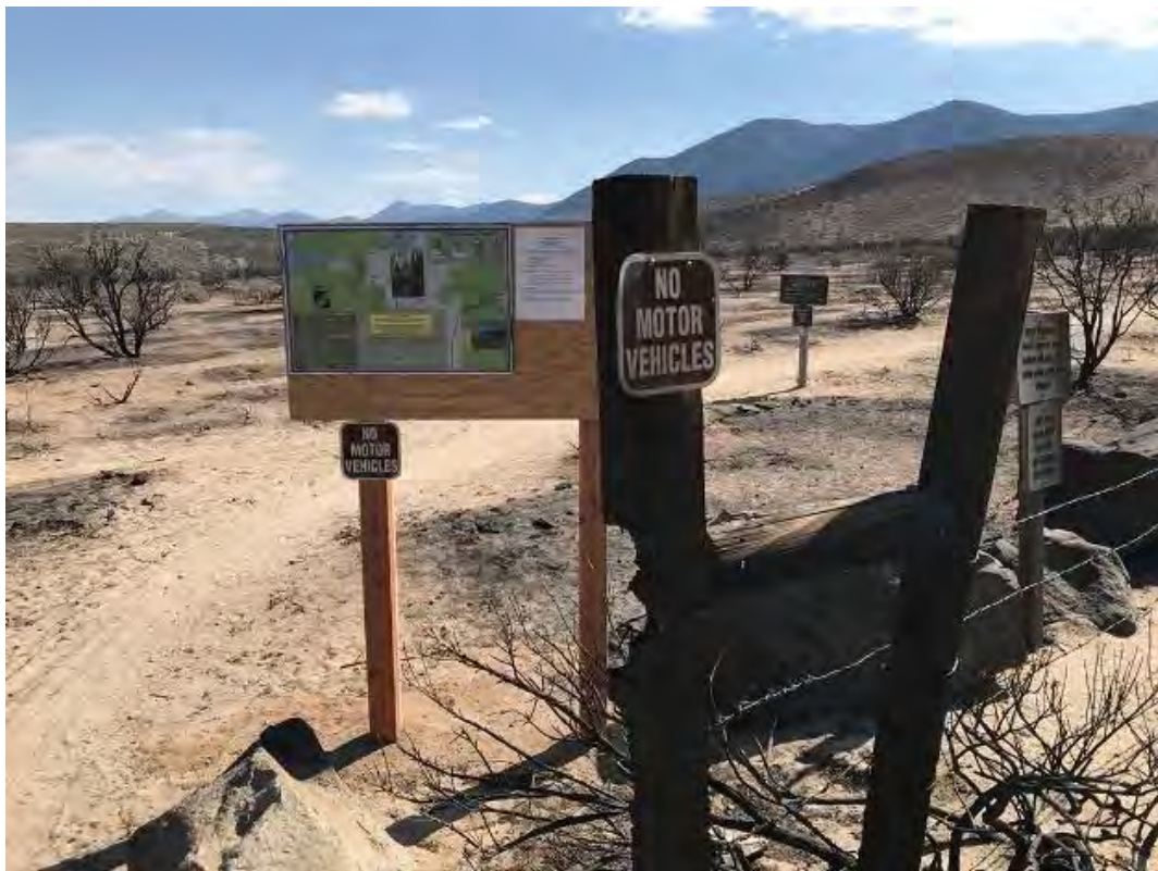
Kiosk posts and panel