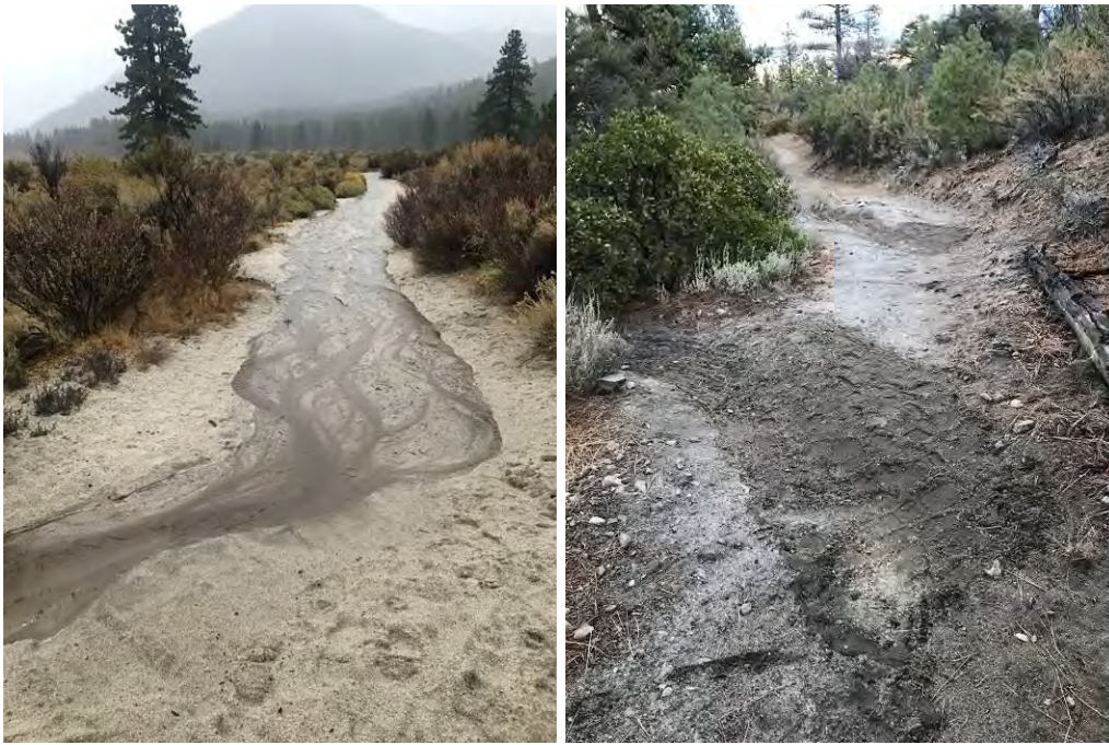
Waterbar maintenance on Sandy Trail/Grand View Loop