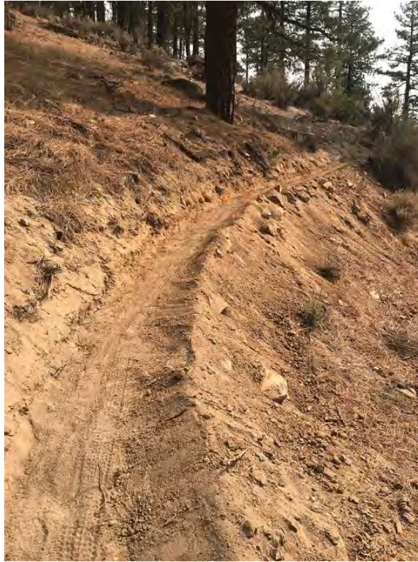
Trail section improved