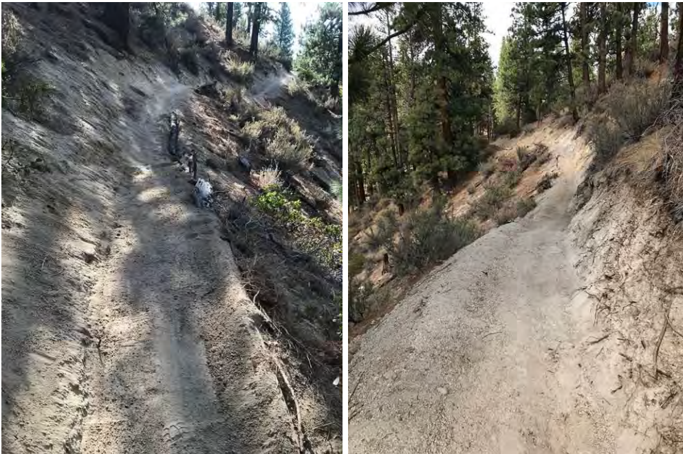
Trail section improved