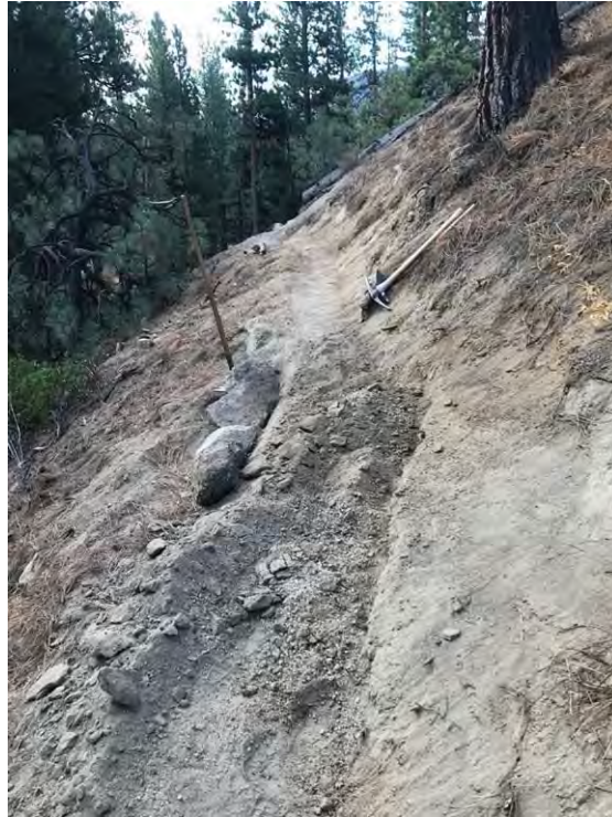
Trail section improved