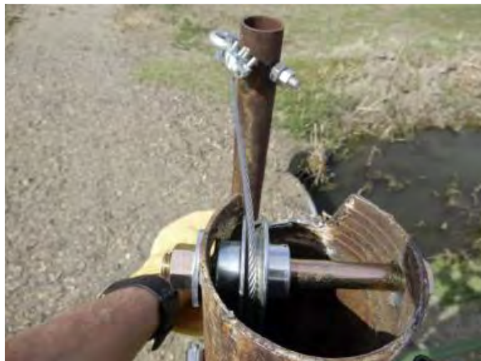
New sheave pulley with locking collars, bolt and cable

3) The Muller Lane gate cable system was replaced with new hardware.