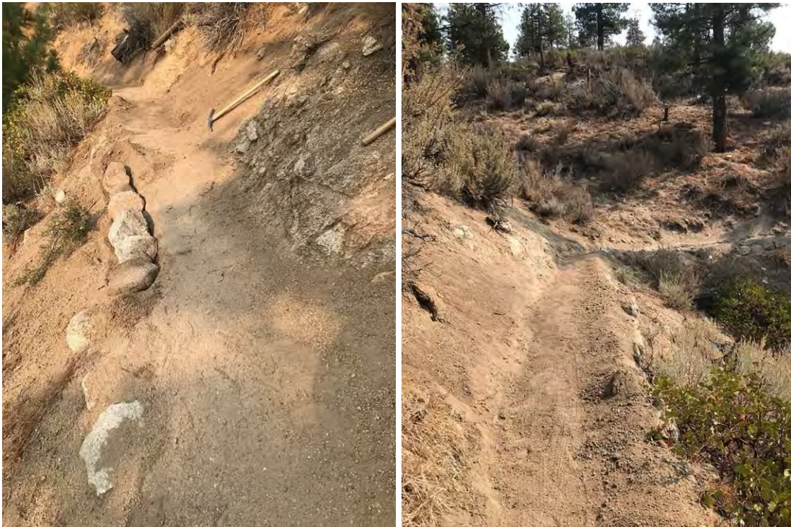
Trail section improved