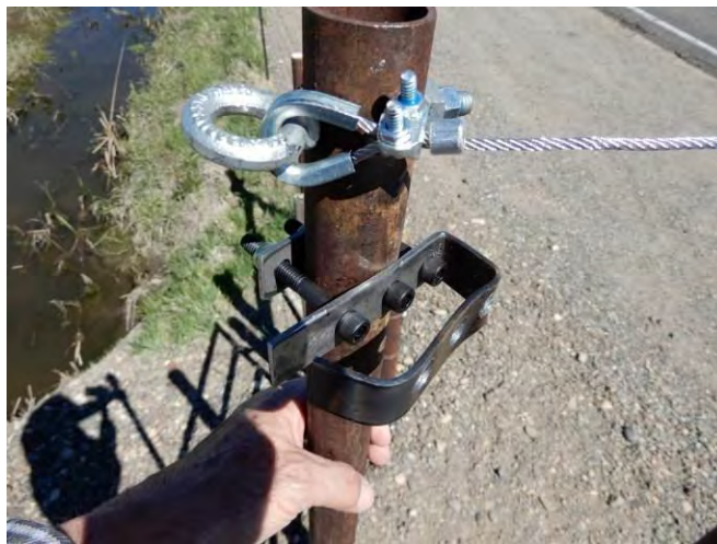
New post eye bolt, thimble, clamp and steel spring