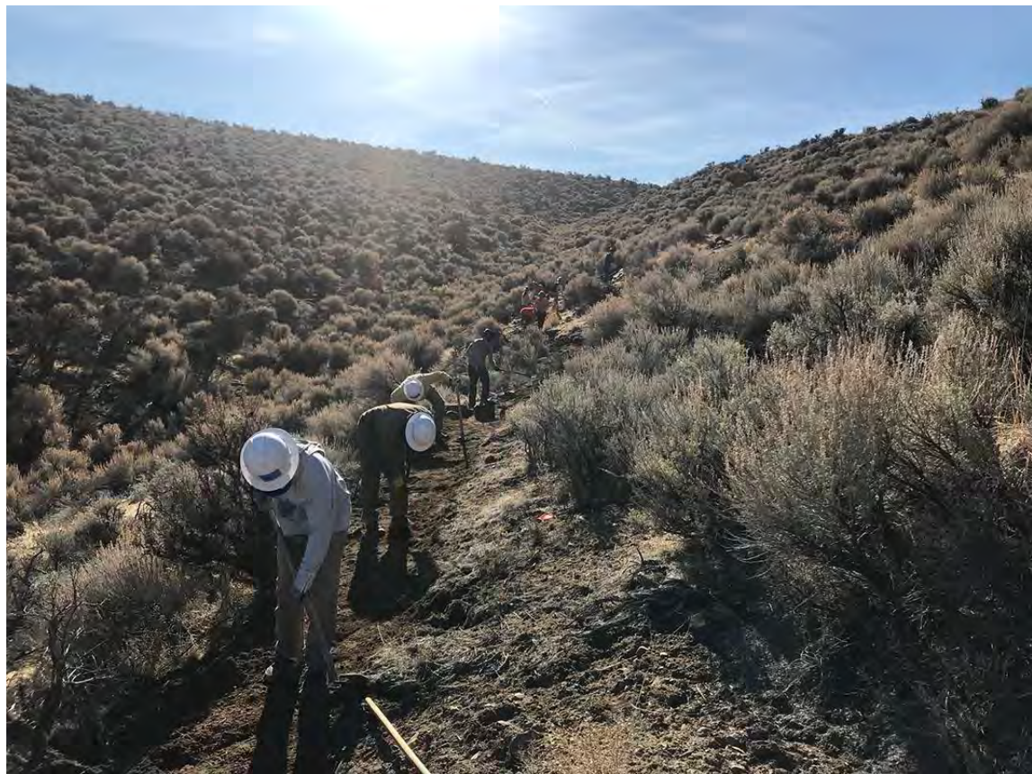
Lower Clear Creek Trail System Construction