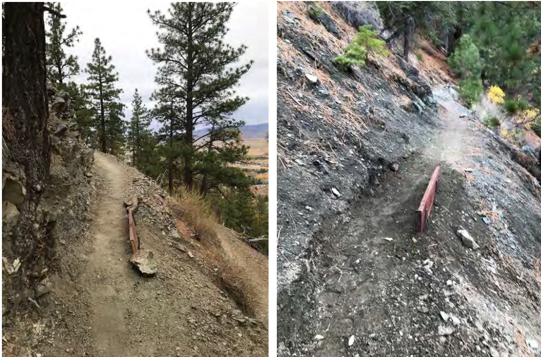
Protective boards installed