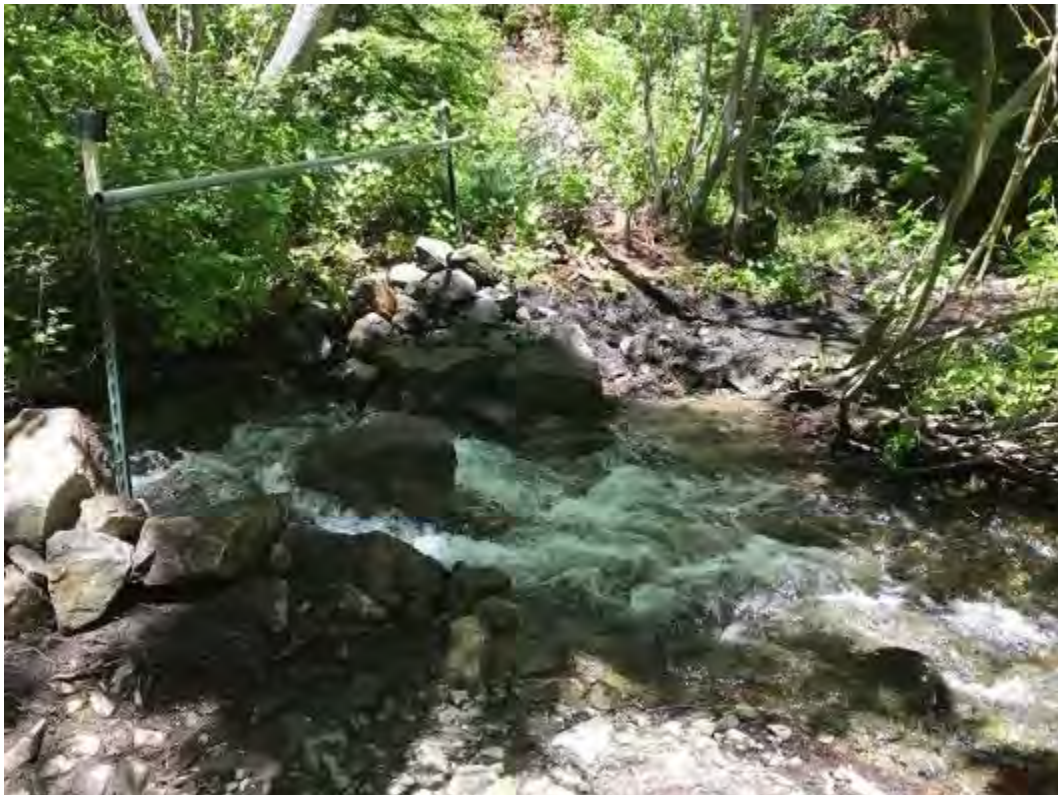
Rock step crossing improved

12) Brushing was done from the Eagle Ridge Trailhead to Sierra Canyon Trail.