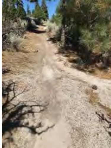
Breached waterbar rebuilt