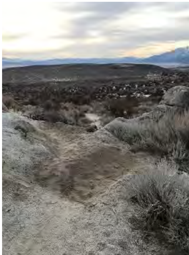
Trail widening, drainage work and armoring