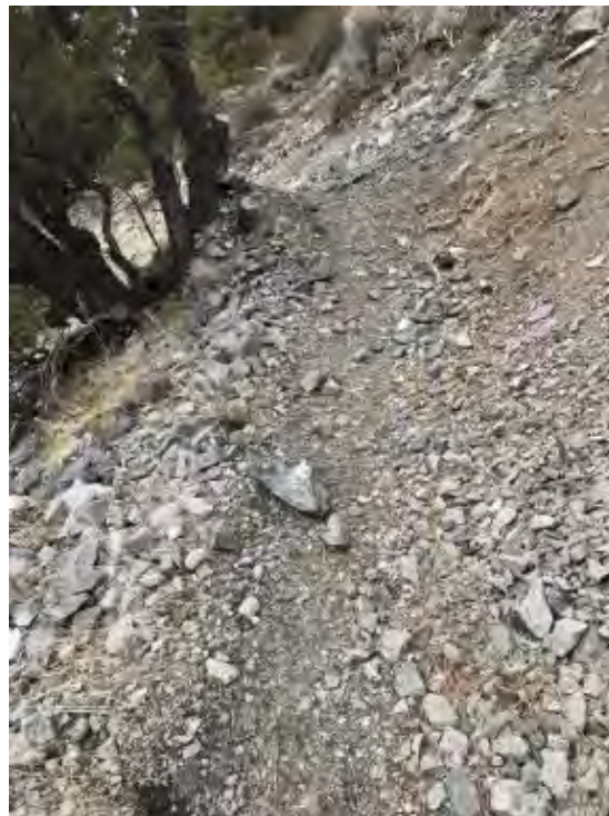
Genoa Loop cleared of fallen rocks