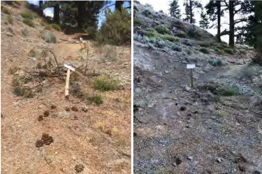
Sign post replaced