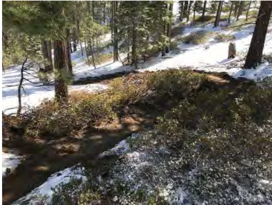
Climbing turn improved