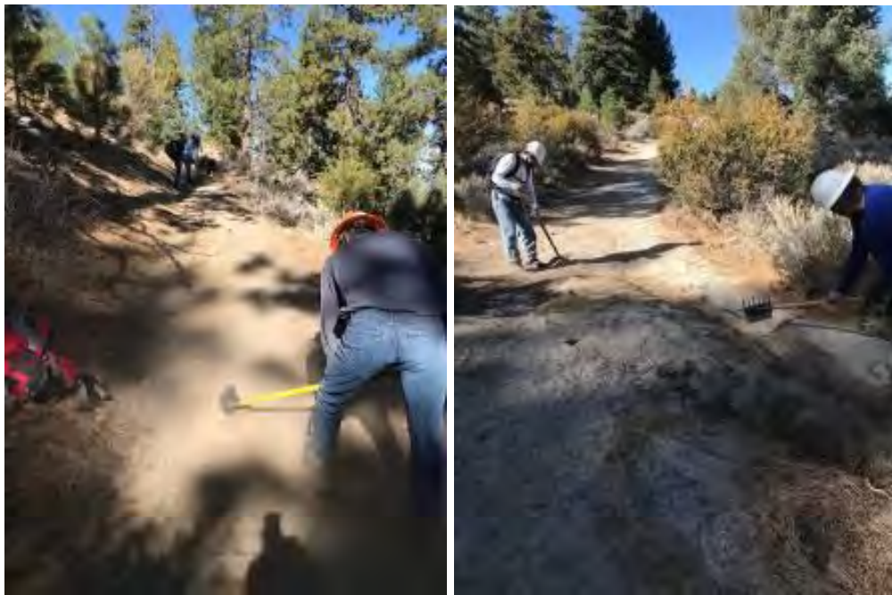
Cleaning out water bars