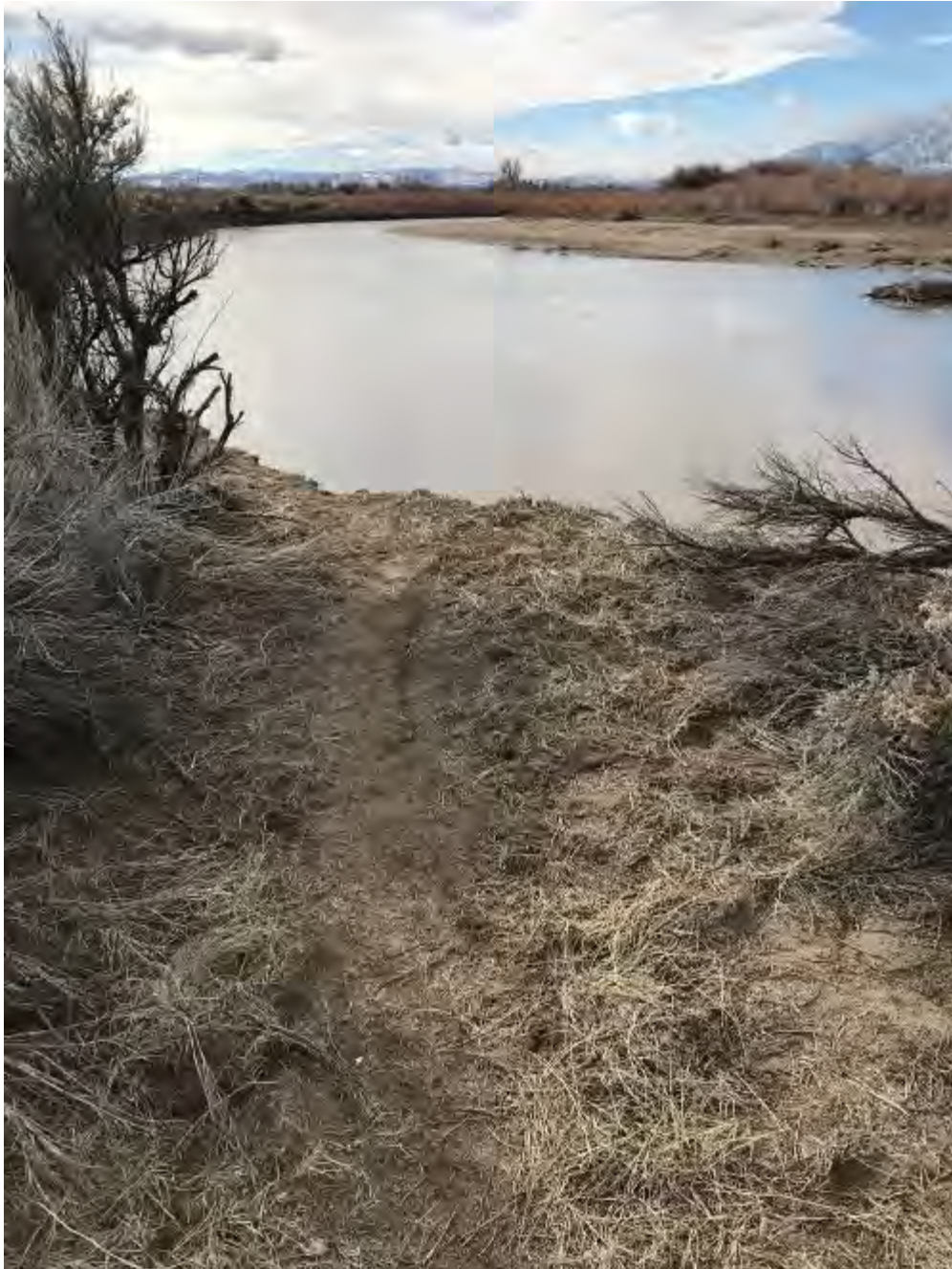
Section of trail washed away and relocated