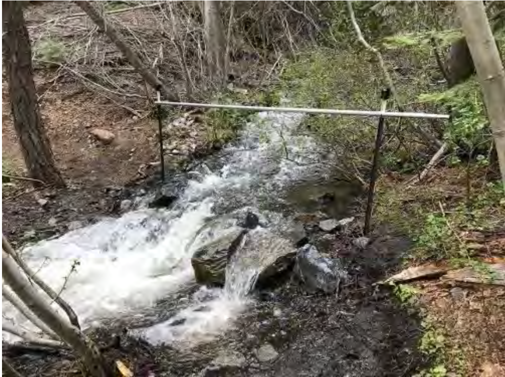
Handrail installed on upper Sierra Canyon crossing