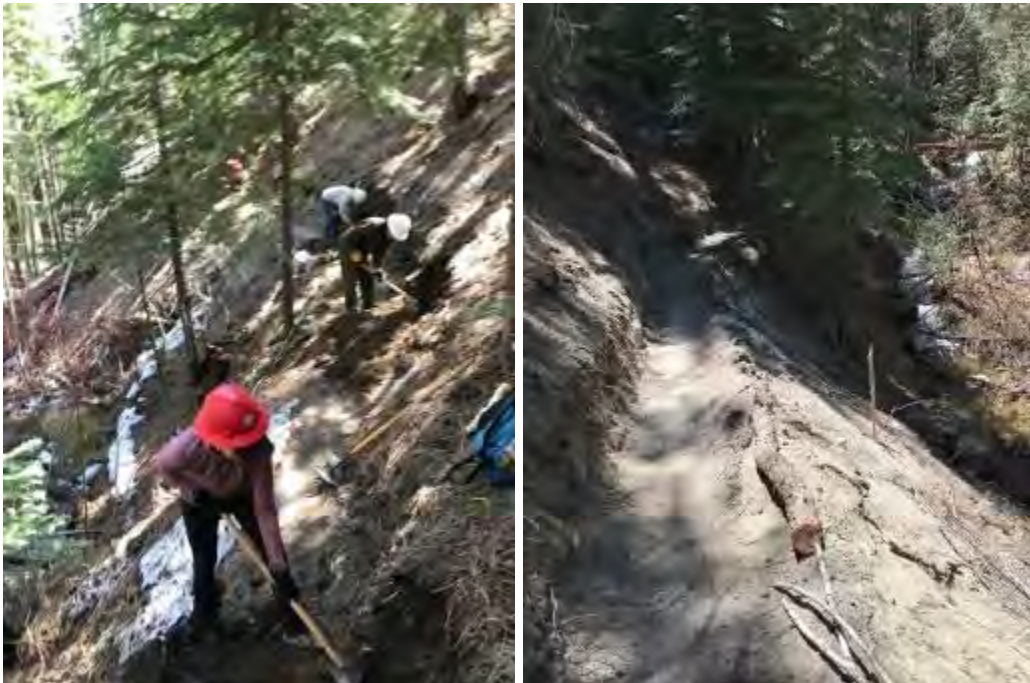
Trail widened on steep cross slope section