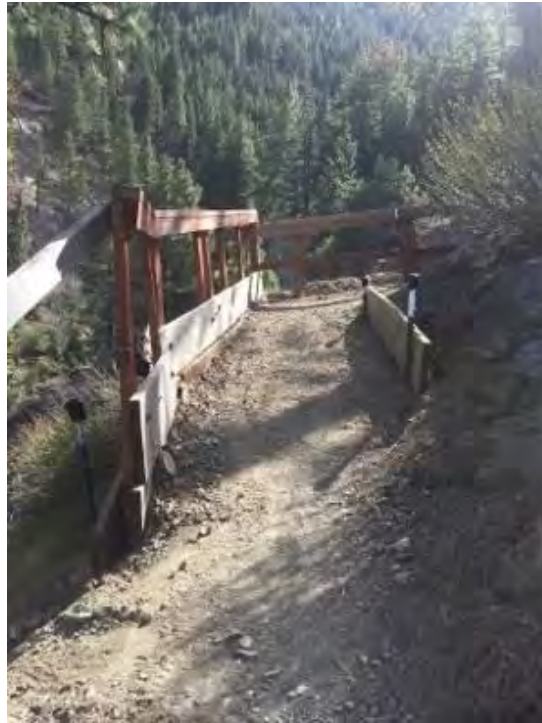
Inner debris support wall cleaned out