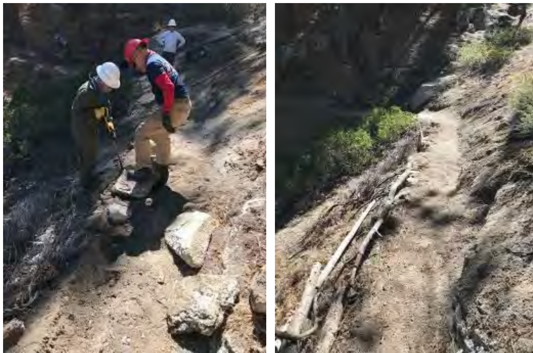
Trail section rock armored

22) A 40-foot slickrock trail section was armored to stabilize the outer trail edge.