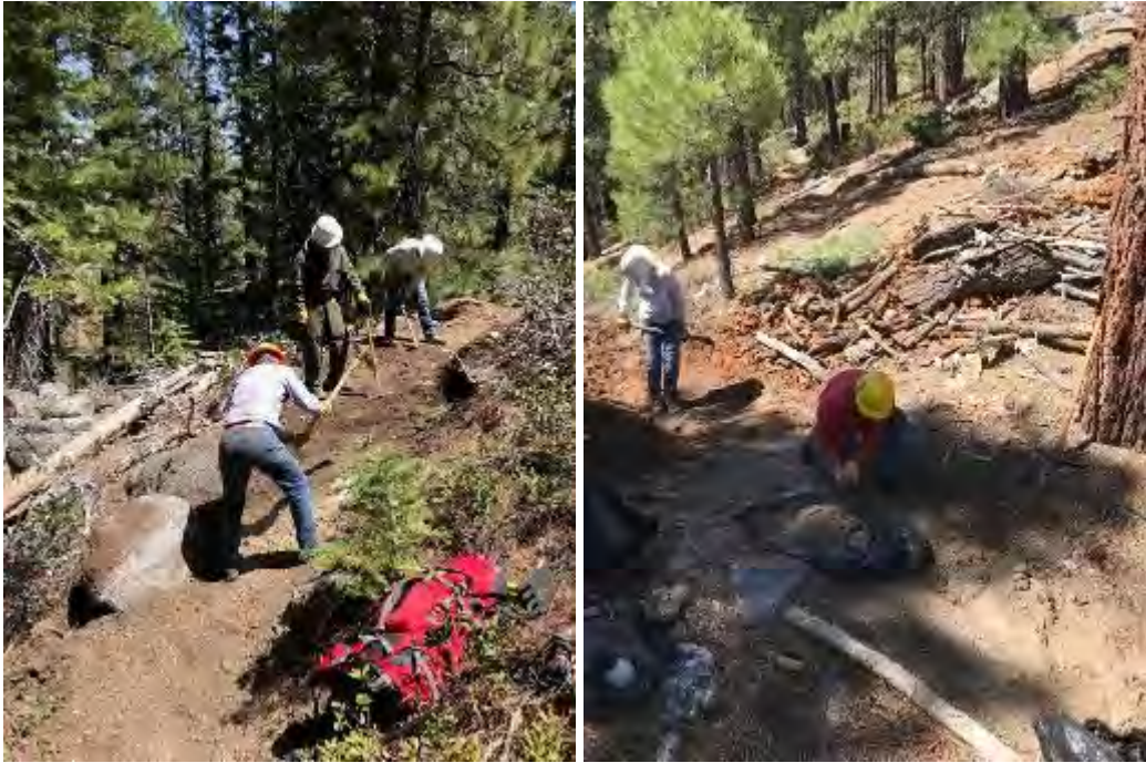
Sight line improved along two trail ridge turns