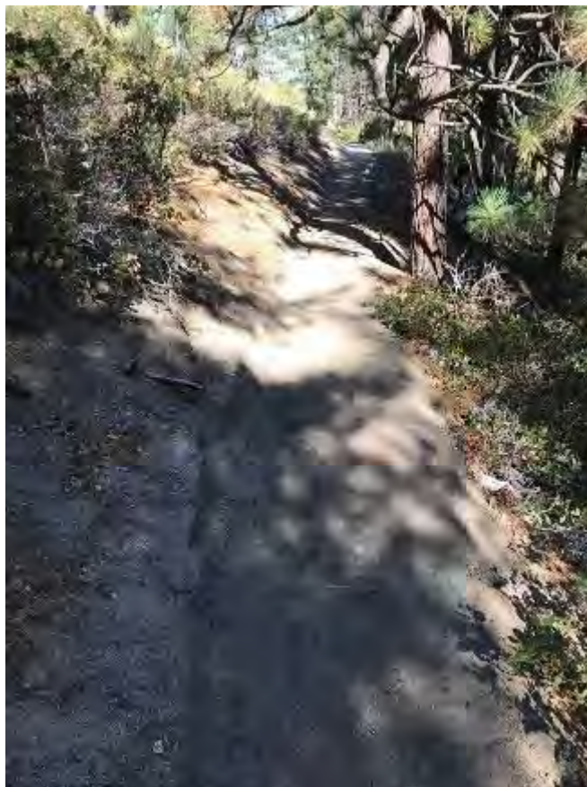
Trail section re-benched