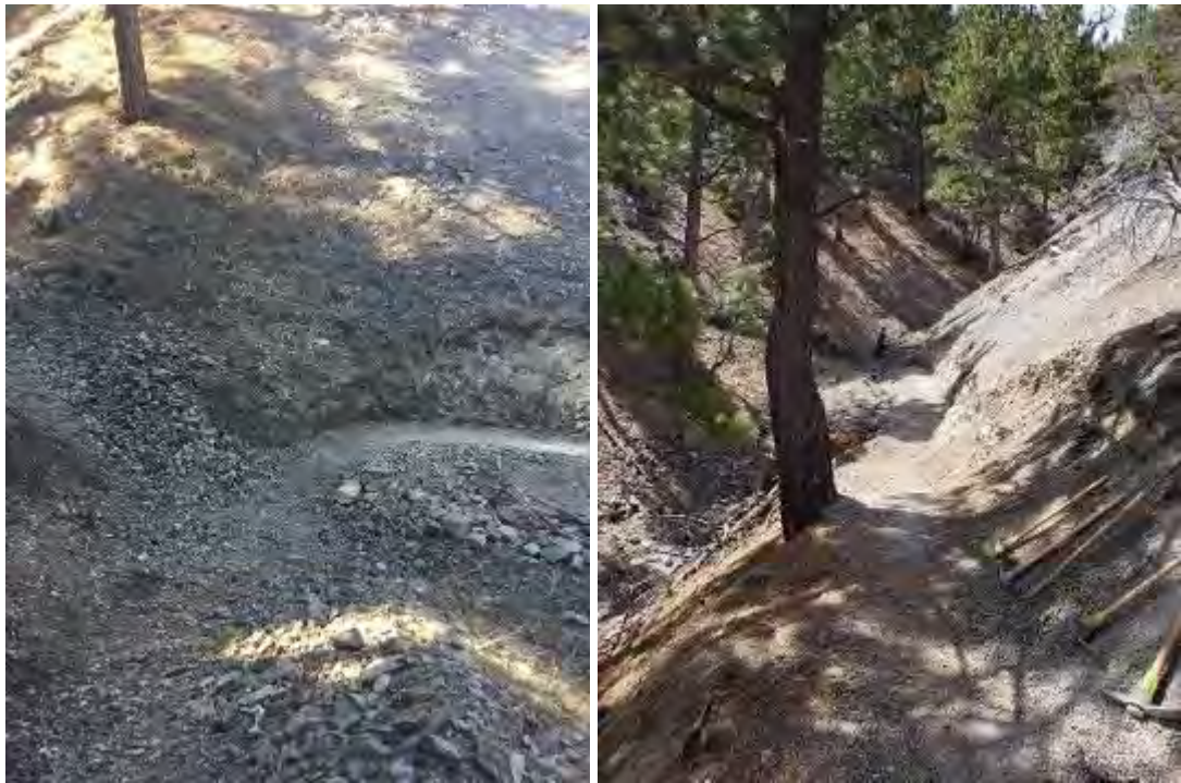
Improved drainage crossing