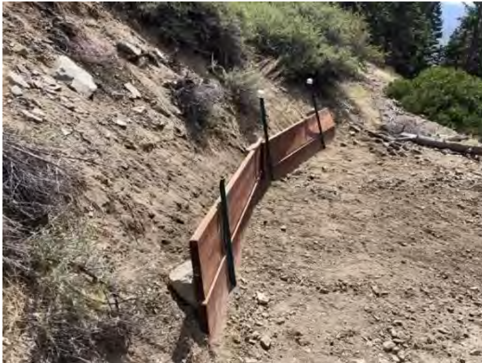
Backslope fill cleared