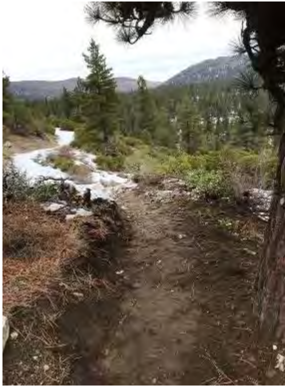
Trail widening and safer sightline