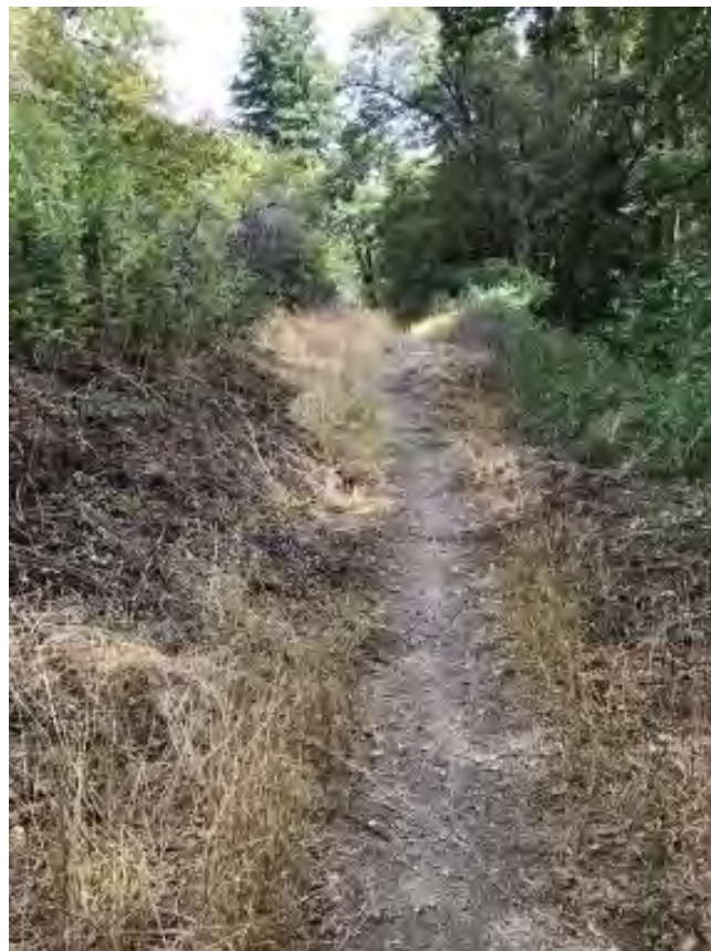
Genoa Canyon brushed out