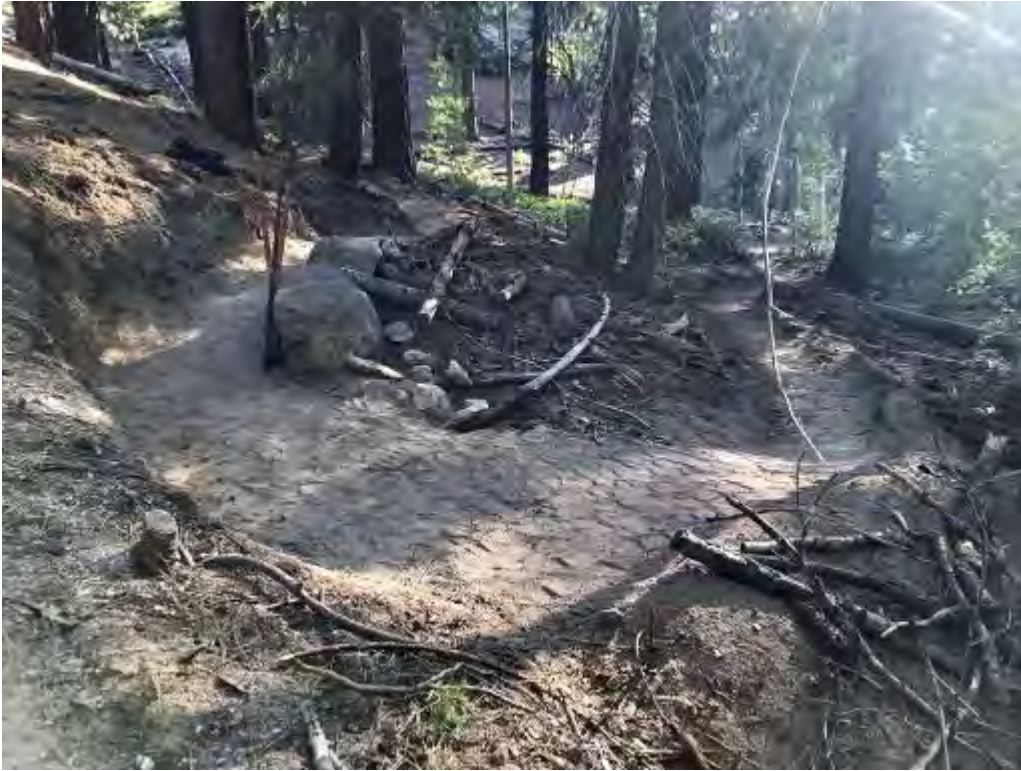
Climbing turn widened