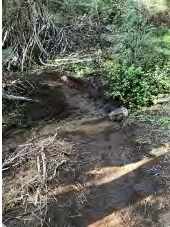
Stepping rock installed