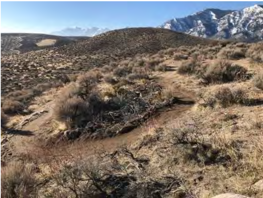
Climbing turn improved