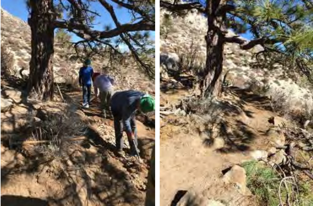
Trail realigned below tree