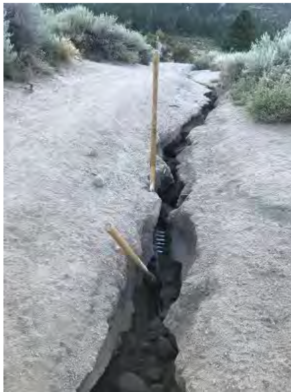
Trail damages repaired