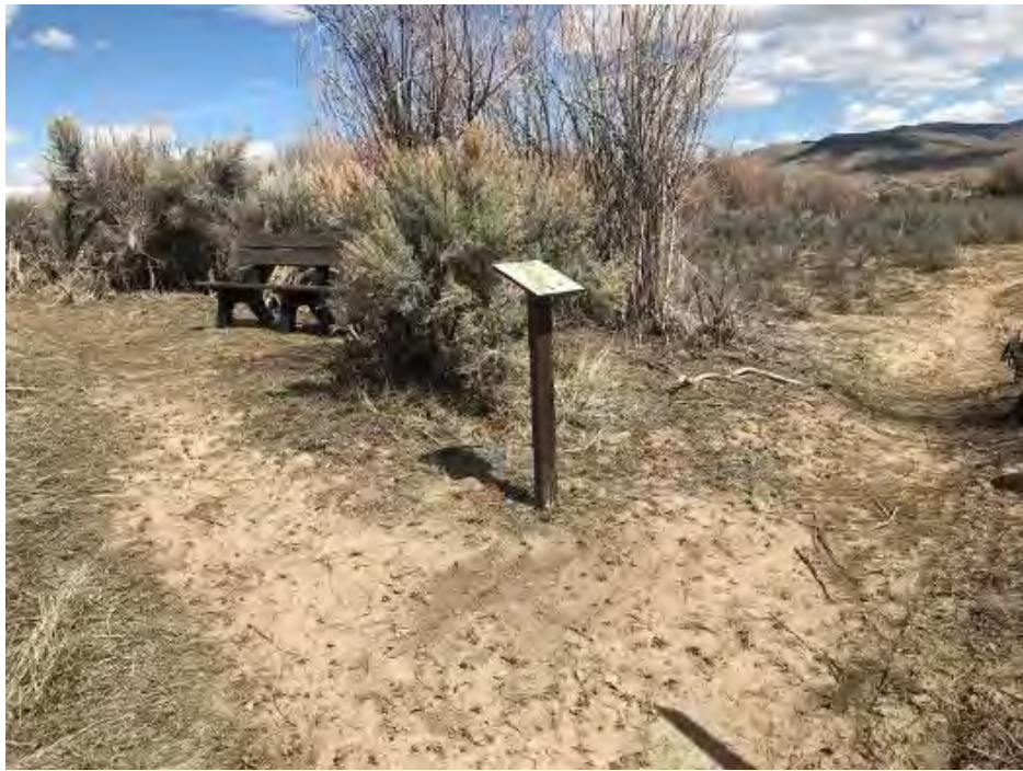
New junction maps installed