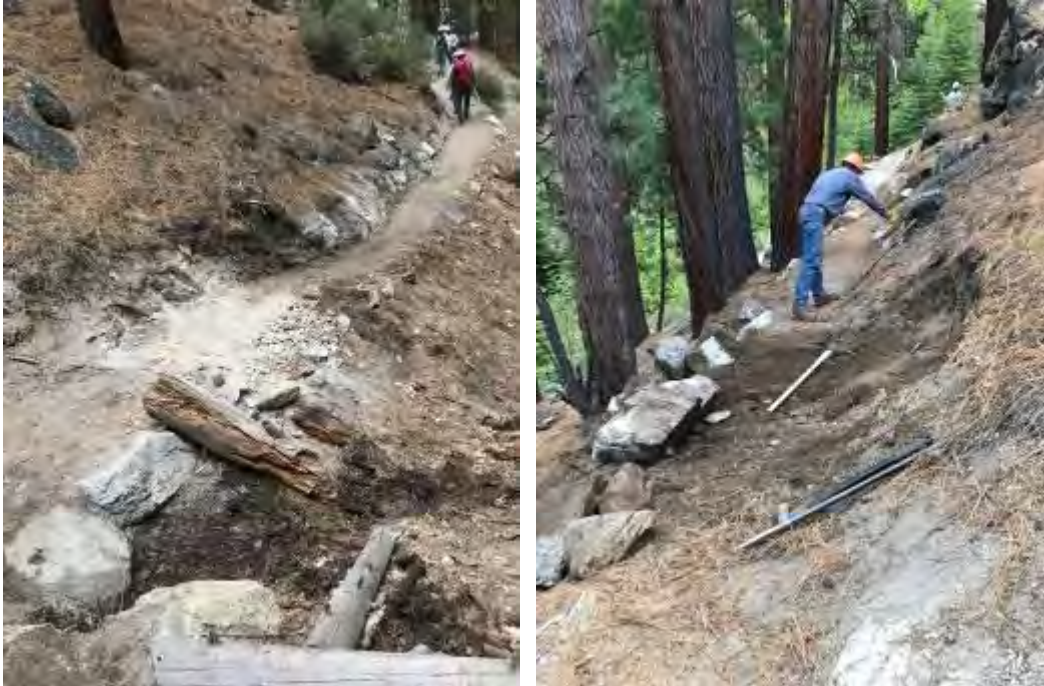
Two trail sections armored and improved