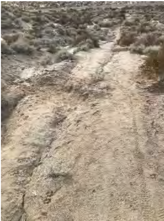
Drains on old road...