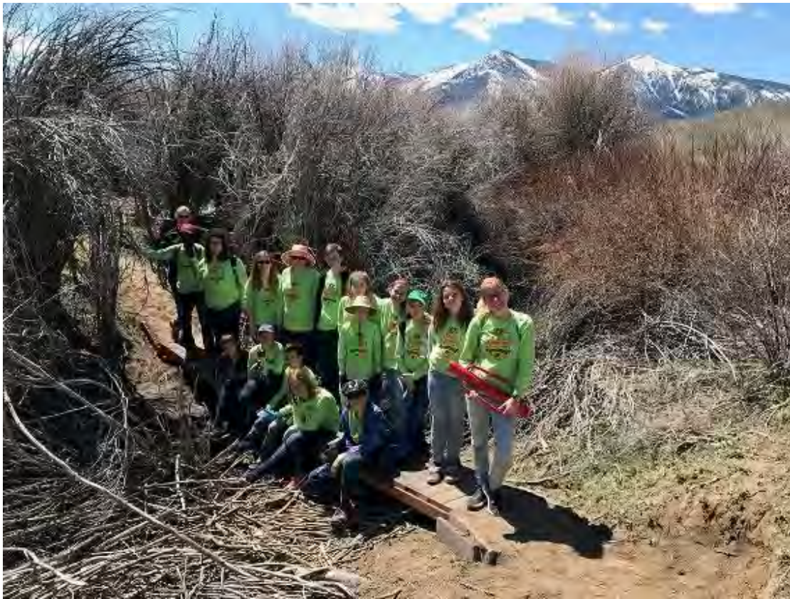
Boardwalk install with Grace Christian Academy