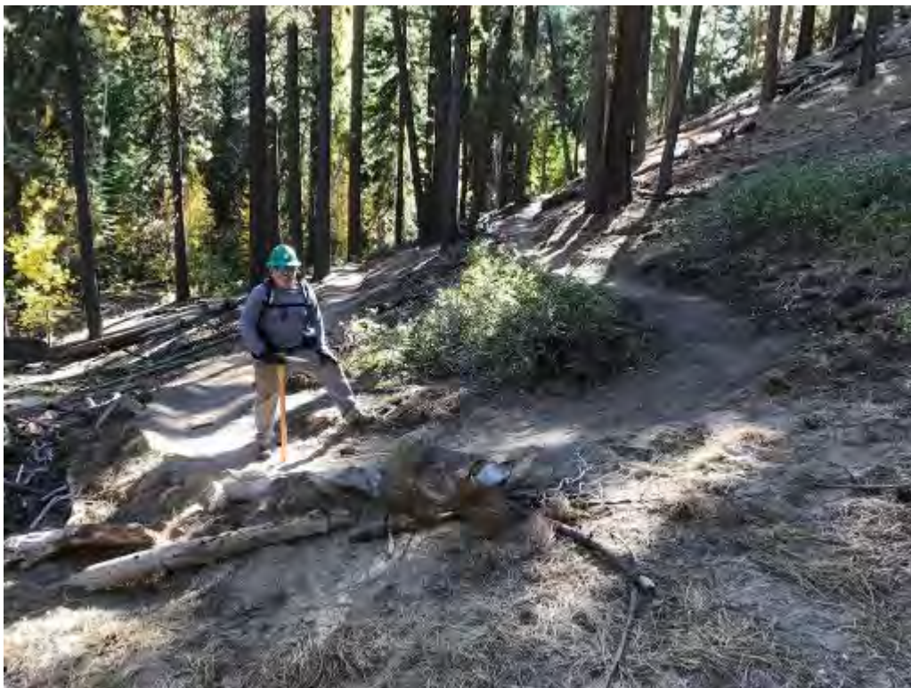
Climbing turn improved