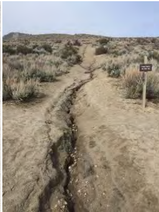
to help prevent this