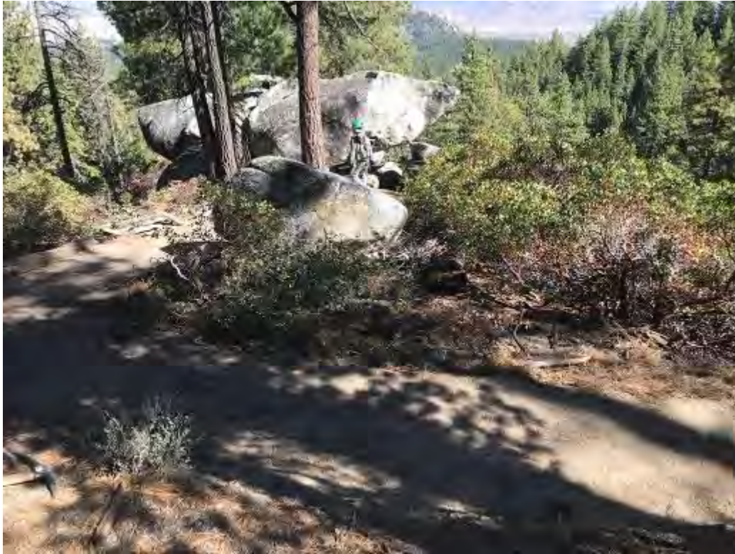
Climbing turn improved

21) The climbing turn next to Finger Gap Rock was improved for better trail flow.