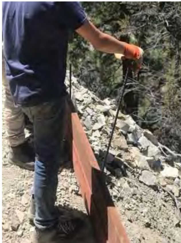
Trail bumper in Genoa Canyon