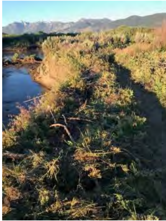
One of three realignments