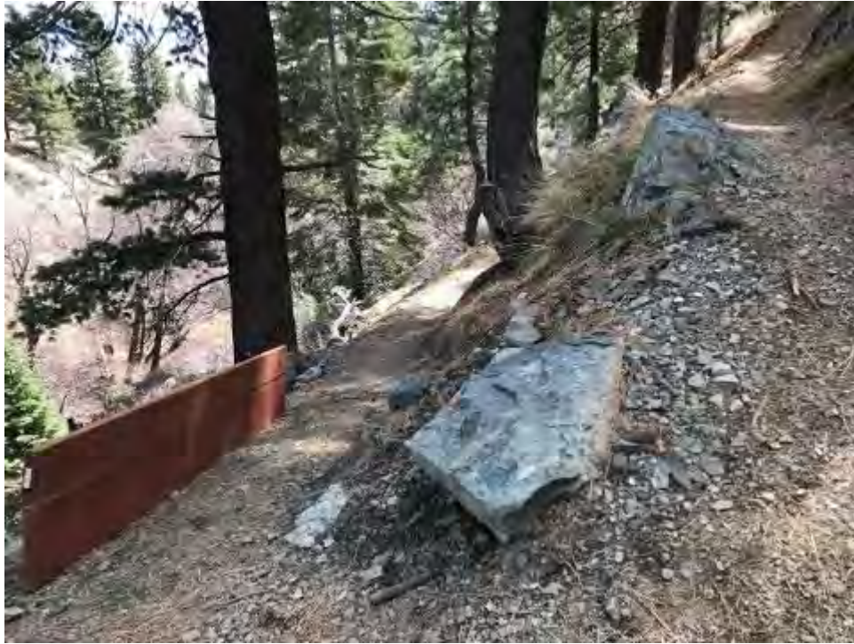
Trail bumper in Genoa Canyon