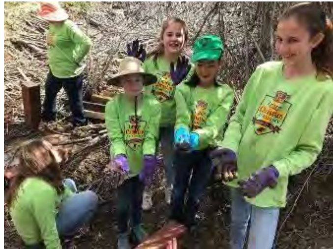
Boardwalk install with Grace Christian Academy