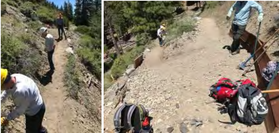
Lower edge bumper wall on Sierra Canyon Trail