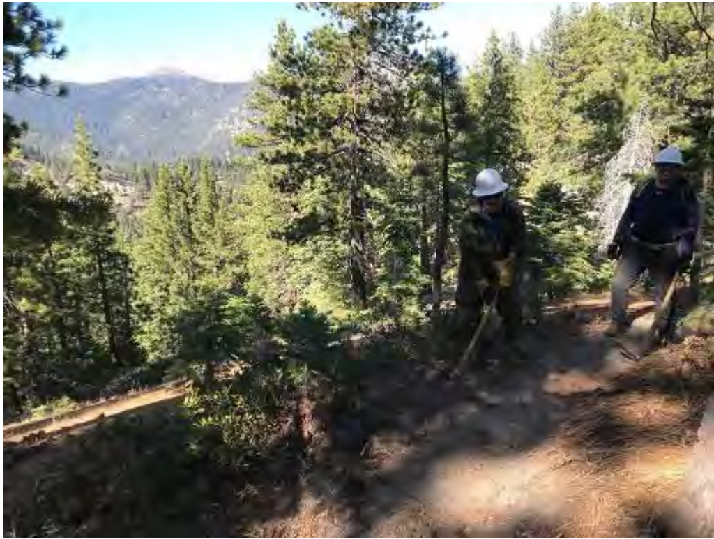
Brushing out bush chinquapin