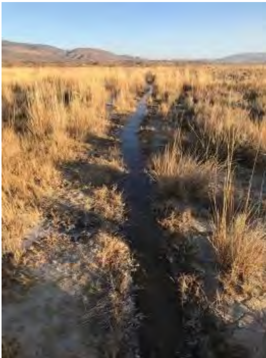
Wet trail section moved to dry ground