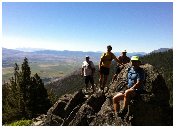
Sierra Canyon Trail Runners

The Carson Valley Trails Association is a non-profit, volunteer based organization working with partners to provide access to public lands through a recreational trail system for present and future generations to enjoy.