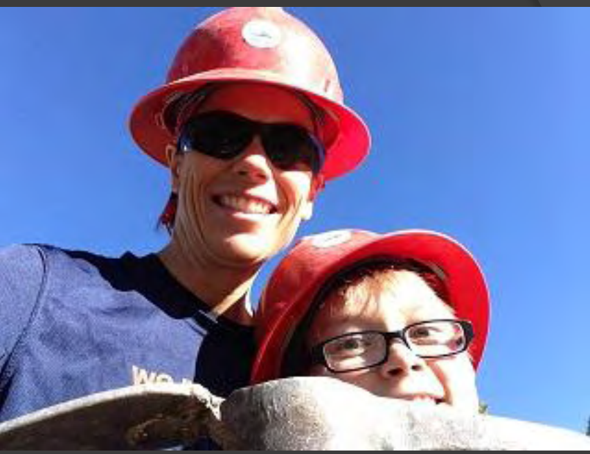
Fun times- they're always good!