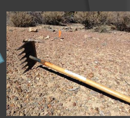
Can be dangerous, too.