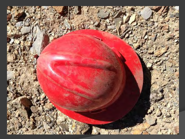
Safety first, always.