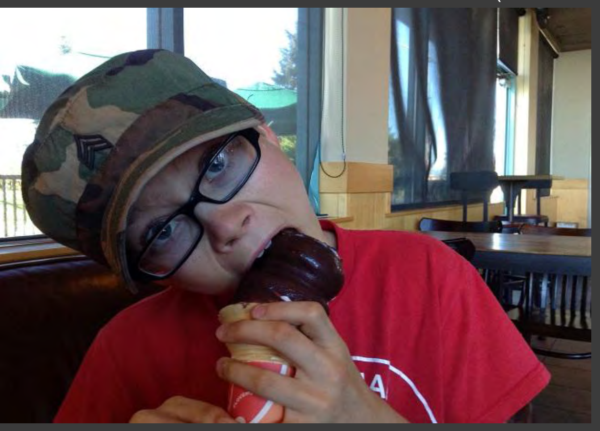
Rewards of the Trail (continued)