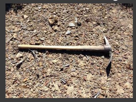
A pick ax for the heavy duty rock clearing= my favorite!