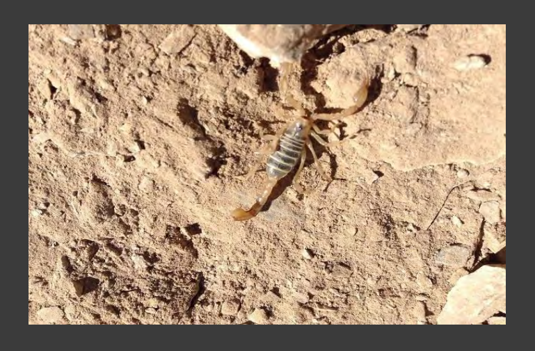
Scorpions-They like to hide under rocks.